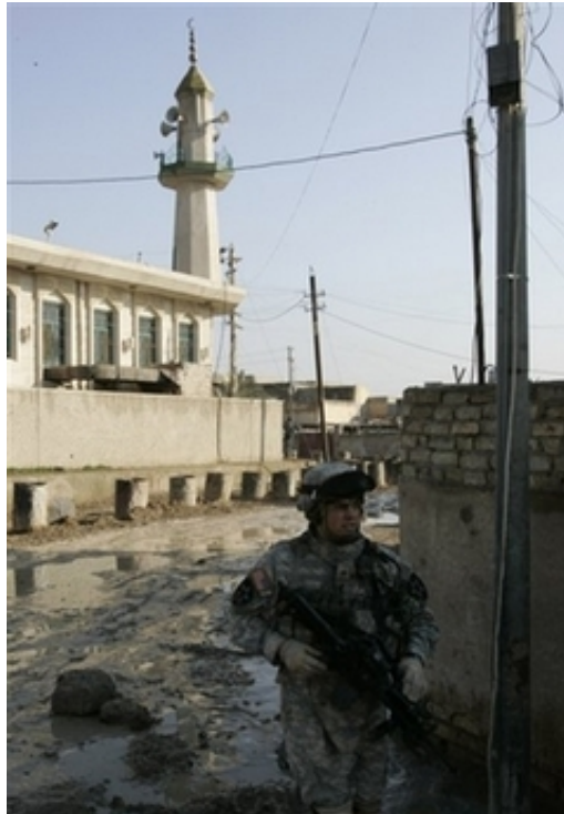
A U.S. Army soldier from Company B of the 5th Battalion, 20th Infantry Regiment, patrols a street in New Baghdad, Dec. 24, 2006.