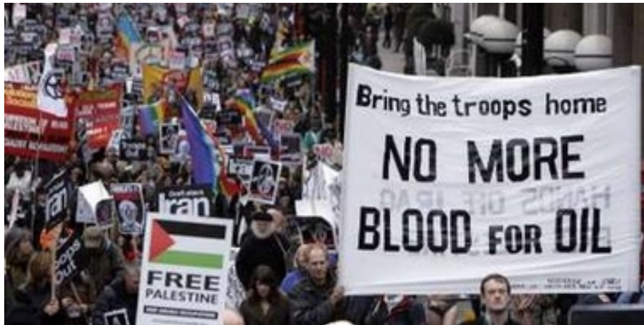
Protestors march during the Troops Out of Iraq demonstration in London February 24, 2007.