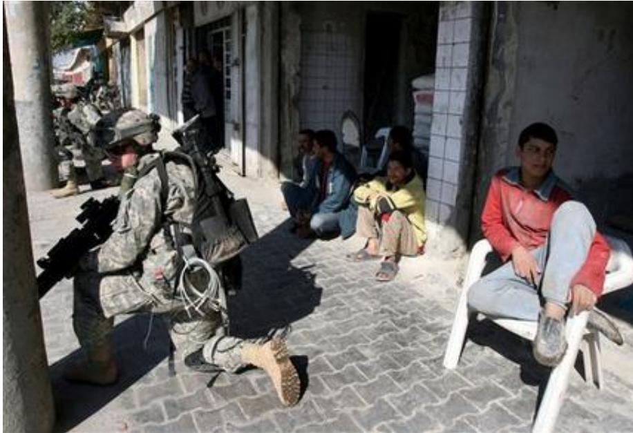
Members of the U.S. Army 2nd Brigade 82nd Airborne Division on patrol in central Baghdad Feb. 17, 2007. 2/17/07). [Thanks to D, who sent this in.]

REALLY BAD IDEA: NO MISSION; HOPELESS WAR: BRING THEM ALL HOME NOW