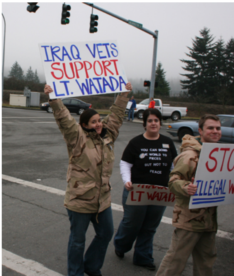
Iraq Veterans Against The War at Ft. Lewis Gates Feb. 5, 2007