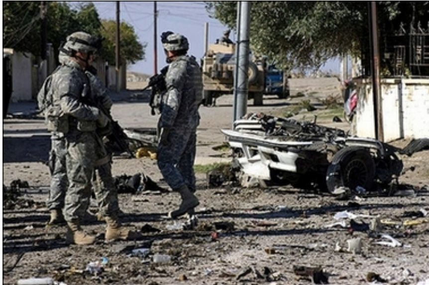
12.1.06 US soldiers at the site where a car bomber attempted to ram a joint US-Iraqi patrol in the northern oil city of Kirkuk.

REALLY BAD IDEA: NO MISSION; HOPELESS WAR: BRING THEM ALL HOME NOW