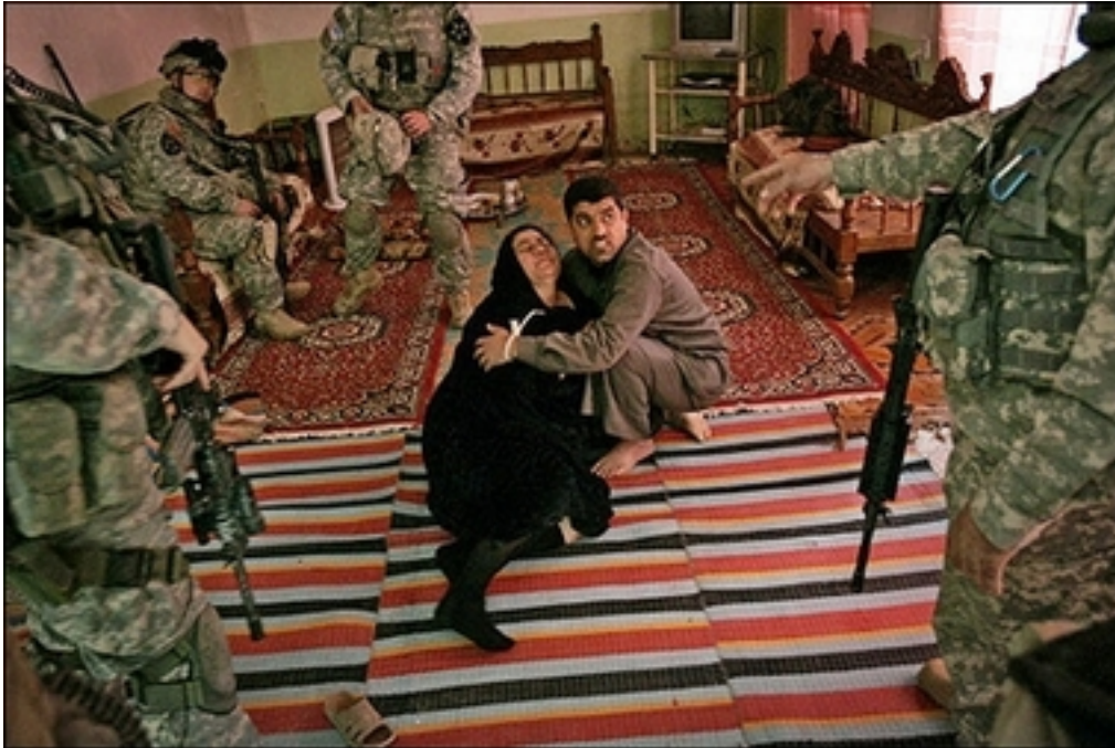
2.6.07

One soldier, on his second tour in Iraq, said the attitude of the Iraqi civilians toward the Americans continues to deteriorate.