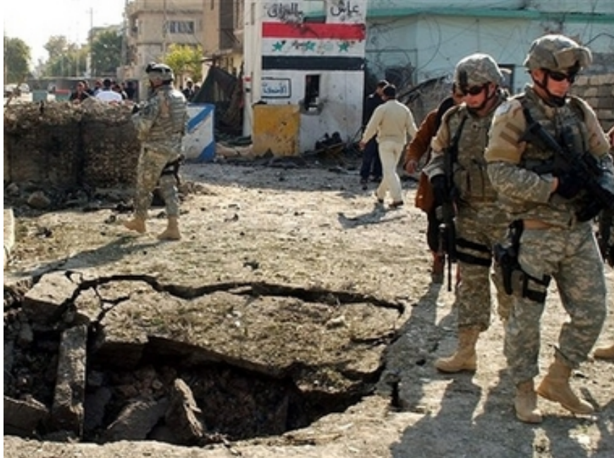
U.S. soldiers following a car bomb explosion in Mosul, Nov. 29, 2006.

THERE IS ABSOLUTELY NO COMPREHENSIBLE REASON TO BE IN THIS EXTREMELY HIGH RISK LOCATION AT THIS TIME, EXCEPT THAT A TRAITOR WHO LIVES IN THE WHITE HOUSE WANTS YOU THERE That is not a good enough reason