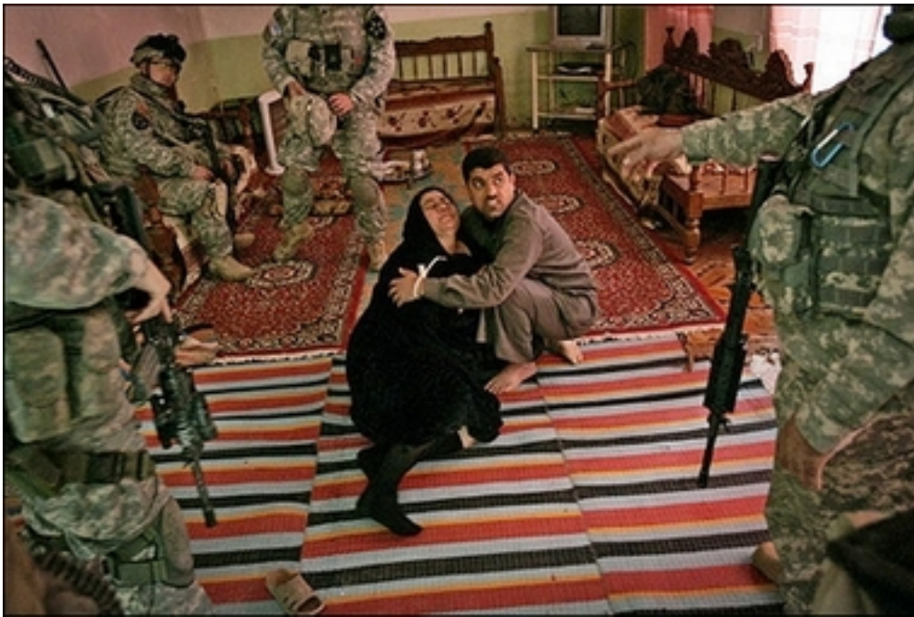
2.6.07

But some of his soldiers saw less reason to be hopeful about either their relations with the Iraqis or the troop increase.