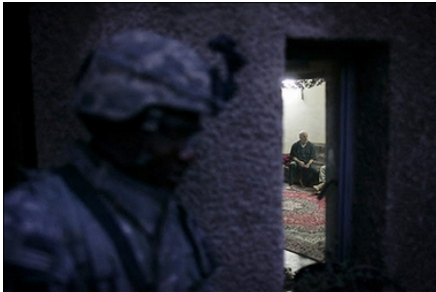
A foreign occupation soldier from U.S. Gator Company 2-12 Infantry Battalion stands guard inside an Iraqi citizen's home as the homeowner is interrogated by a platoon leader in the al-Dora neighborhood of southern Baghdad.