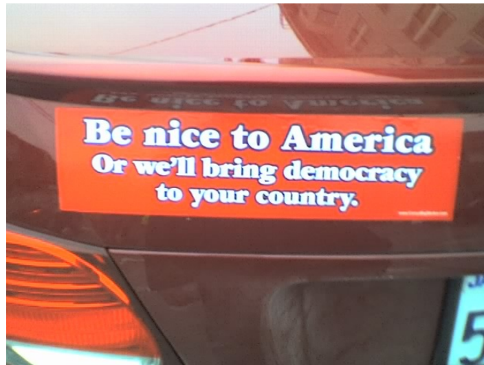
[Ma'Moun Sukkar April 15, 2007]