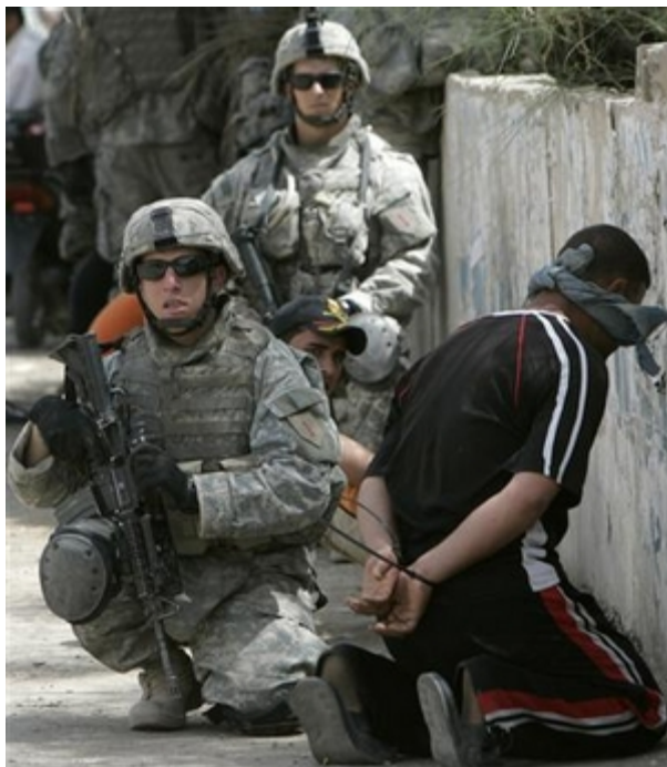
U.S. soldiers stand guard near blindfolded suspected insurgents who were taken prisoner during a raid in Baghdad, April 20, 2007.