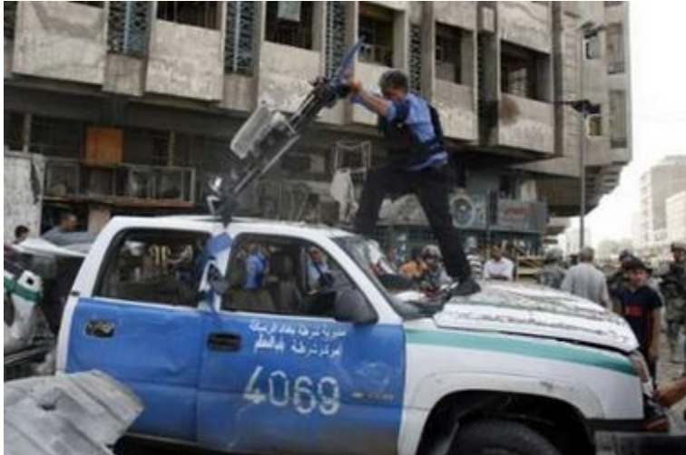
A damaged police vehicle after a bomb attack in Baghdad May 13, 2007.

13 May 2007 Reuters & Echo Publications & AFP & Sapa-AP & (CBS/AP)