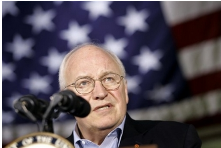
May 10, 2007