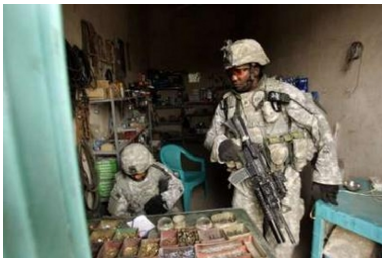
U.S. soldiers search for weapons and explosives in a mechanical store in the town of Tarmiyah May 9, 2007.