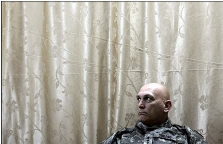
Odious Odierno, in Mosul in April 2007

Odierno The Odious Blocks 1- Month Breaks: Says No To Army Recommendation To Give Soldiers Time Off From Battle: