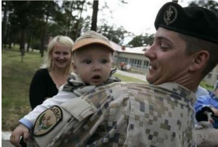
A Latvian Army soldier holds his son after returning home from Iraq with the last unit in Riga June 19, 2007. Latvia is currently withdrawing its military contingent from Iraq.

JP: “What Do You Think Of The Iraq War?” Soldier 1: “If I Told You, I’d Go To Prison For 20 Years!”