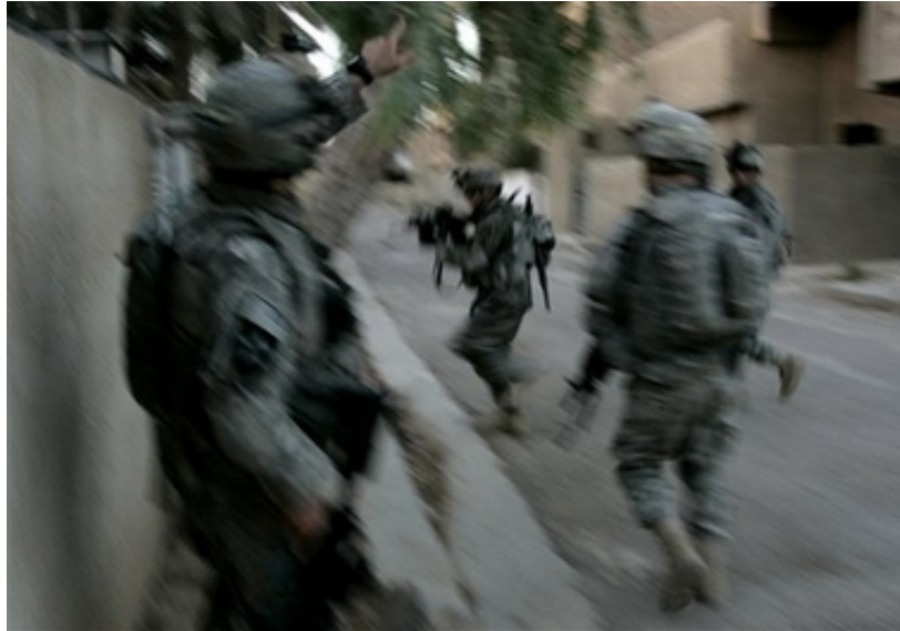
U.S. soldiers of the 2nd brigade, 23rd Infantry regiment run for cover in Rasheed neighborhood in southern of Baghdad early June 19, 2007.

THIS ENVIRONMENT IS HAZARDOUS TO YOUR HEALTH; COME ON HOME, NOW