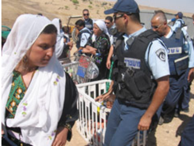
Bedouin residents during the evacuation of the unrecognized Negev villages of Um Al-Hiran and A-Tir. (Mijal Grinberg)

The Bedouin residents living in the area appeared under the title of “special problems” that may affect the establishment of the community.