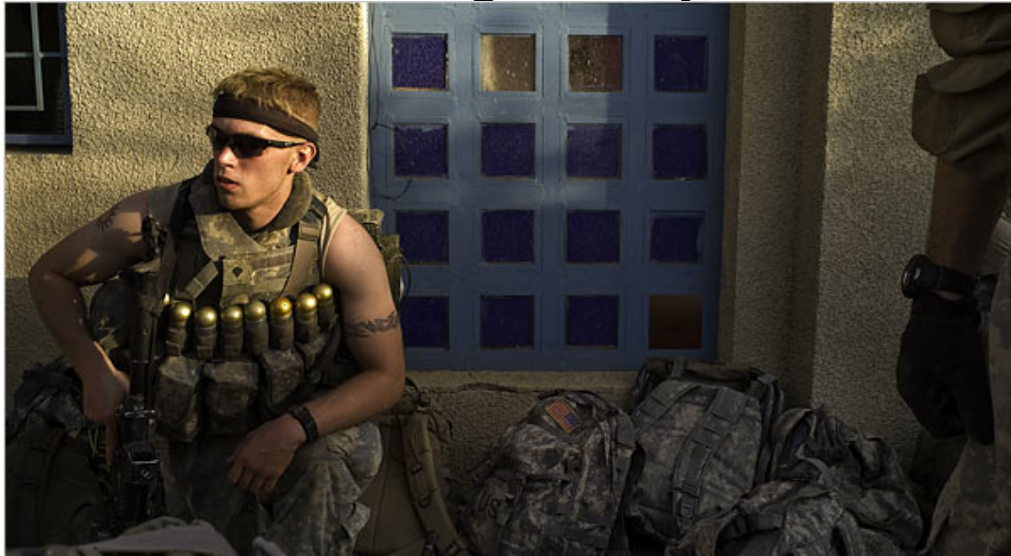
BAQUBA, Iraq, June 25: An American soldier carrying shoulder-fired grenades paused to wait for orders during an operation on Saturday in Baquba, Iraq.