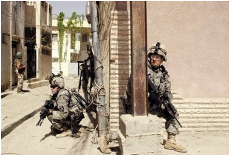
U.S. soldiers in an alley in the eastern part of Baqouba July 21, 2007.