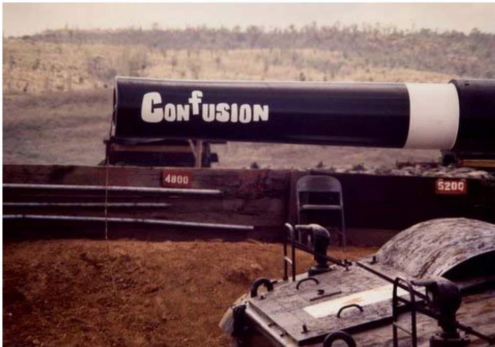
8 inch artillery gun on a firebase near An Khe, Vietnam 1970.