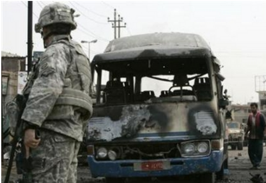
A U.S. soldier stands guard near a burnt bus after a bomb attack in Baghdad, July 30, 2007.