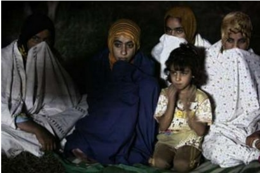
Iraqi citizens and their children sit and watch as foreign occupation soldiers from the U.S. 2nd battalion, 32nd Field Artillery brigade invade their home in the middle of the night in Baghdad August 8, 2007.