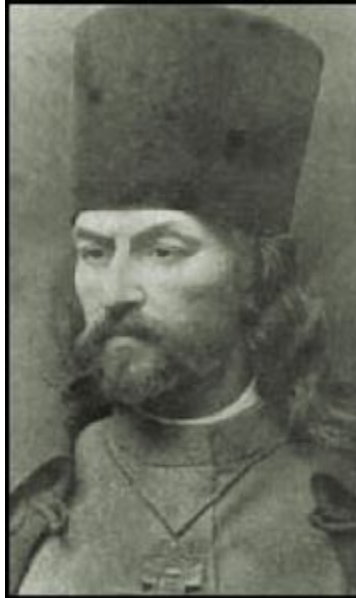
Father Georgi Apollonievich Gapon

Bloody Sunday (Russian: Кровавое воскресенье) was an incident on 22 January 1905 in St. Petersburg, Russia, where unarmed, peaceful demonstrators marching to present a petition to Tsar Nicholas II were gunned down. The event was organized by Father Gapon, who told the Russian working class that the Czar and his government would be moved by their march, their opposition to the Imperial war against Japan, and their requests for reforms. The Tsar's dictatorship ended in 1917, when the Russian working class and soldiers in the Russian army rose in revolution. After the revolution the Czar, whose entry into World War I killed 2 million Russian citizens, was executed.