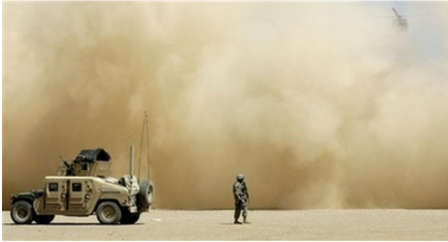
A U.S. military helicopter lands in the village of Qahtaniya, 75 miles west of Mosul, Aug. 19, 2007.