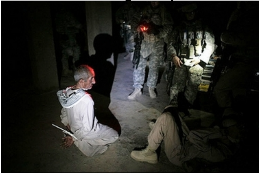
Foreign occupation soldiers from the U.S. 3-509 Para-Infantry Regiment interrogate a temporarily detained Iraqi citizen south of Baghdad, August 2007. He is put in handcuffs and made to kneel down before the foreign soldiers while questioned.