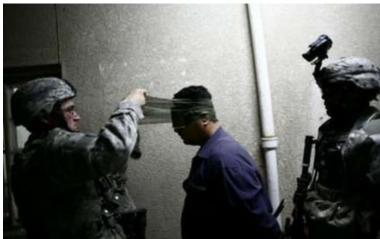
Foreign occupation soldiers from the U.S. arrest a man during a night armed home invasion at the Zafraniya neighborhood, southeast of Baghdad September 4, 2007.