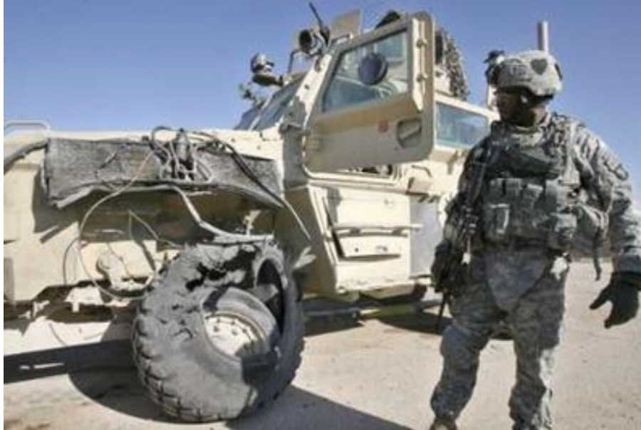
Damaged U.S. armoured vehicle after it was hit by a roadside bomb attack in Latifiya, 50 km (31 miles) southwest of Baghdad December 12, 2007.