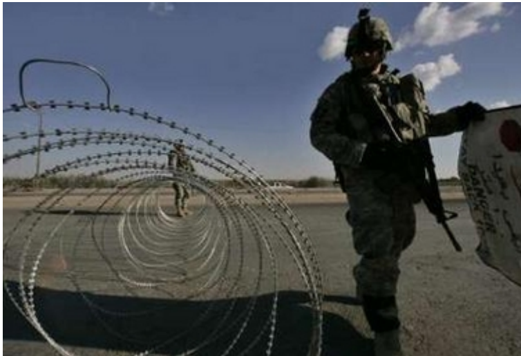
U.S. soldiers with 1st Platoon, Alpha Company, I-327th Infantry 1st Brigade Combat Team, 101st Airborne Division Air Assault, set up concertina wire to close a road after discovering a homemade explosive during a patrol in Baiji November 24, 2007.