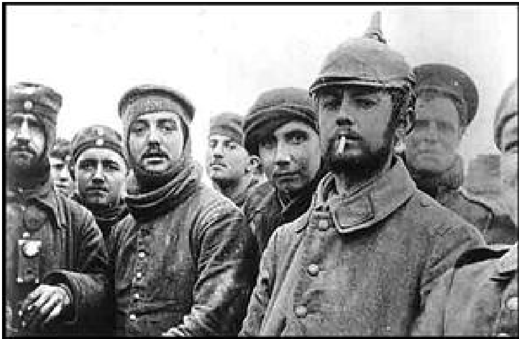
German and British soldiers fraternize – Christmas 1914