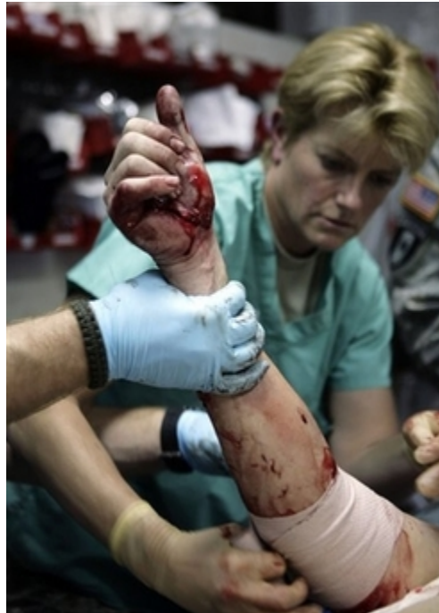
A U.S. Army doctor bandages the arm of a soldier wounded by a roadside bomb at Ibn Sina Hospital in Baghdad Dec. 13, 2007.