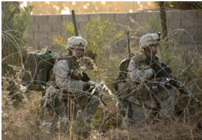
U.S. soldiers patrol a village in Ramadi, west of Baghdad, December 8, 2007.