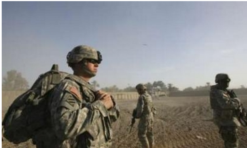
U.S. soldiers wait for their helicopter in Baghdad November 6, 2007.