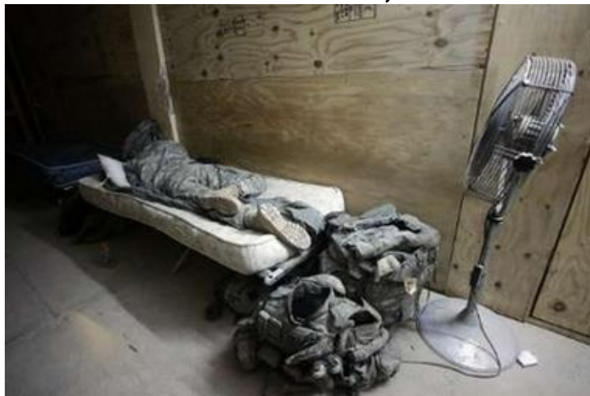
A U.S. soldier with 1st Platoon, Alpha Company, I-327th Infantry 1st Brigade Combat Team, 101st Airborne Division Air Assault, sleeps after a night patrol in Bayji (Baiji) November 26, 2007.