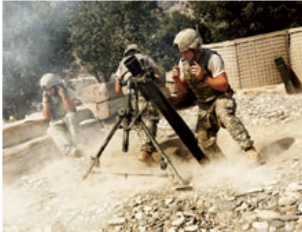
The 120-mm.-mortar squad at the KOP base.

Ten minutes later we’re moving again, and just outside the kop we take two bursts of machine-gun fire that stitch the ground behind us and make leaves twitch over our heads.