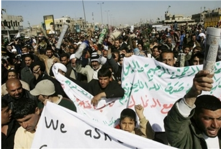
Iraqis demand an end to the US Occupation in Sadr City in Baghdad, Iraq, Feb. 22, 2008.