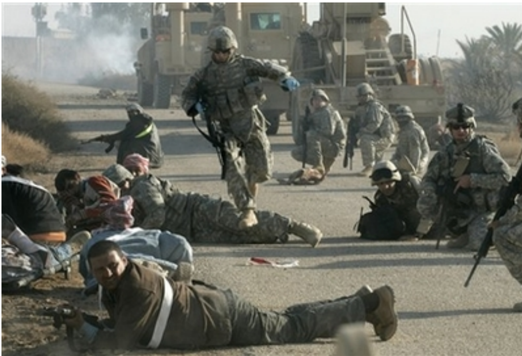
U.S. soldiers of the 3rd Brigade Combat team, 3rd Infantry Division after the second roadside bomb explosion of the day during the Sukhumi clearing operation in the area of Al-leg, south of Baghdad, March 7, 2008.