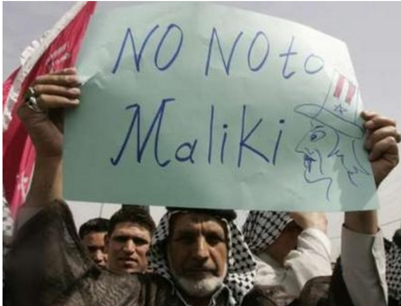
A man holds up a banner depicting Iraqi Prime Minister Nouri al-Maliki as an American pawn during a protest in Sadr City, Baghdad March 26, 2008.

A resumption of intense fighting by al-Sadr's Mahdi Army militia could kill more U.S. soldiers and threaten — at least in the short run — the security gains Washington has hailed as a sign that Iraq is on the road to recovery.