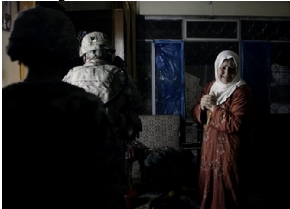
An Iraqi citizen in tears as foreign occupation soldiers from the U.S. leave her house after a night home invasion and search of her belongings in Mosul, March 21, 2008.

U.S. Occupation Commands' Stupid Terror Tactics Recruit Even More Fighters To Kill U.S. Troops