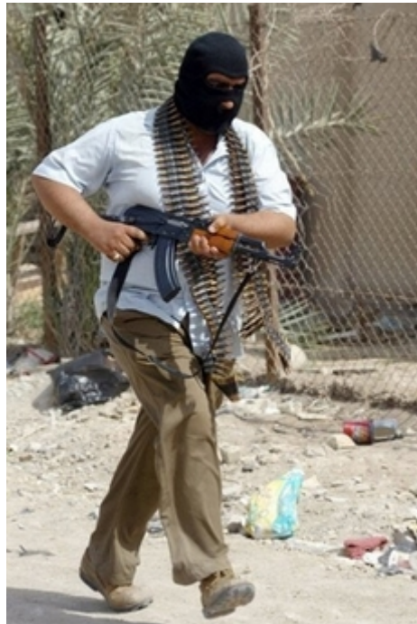
3.25.08: An Iraqi Mahdi Army soldier during clashes in Basra.

On Wednesday, fighting broke out in the Mahdi Army strongholds of Al-Gaazaiza, Al-Garma, Khmasamene, Al-Hayania and Al-Maqal, witnesses said.