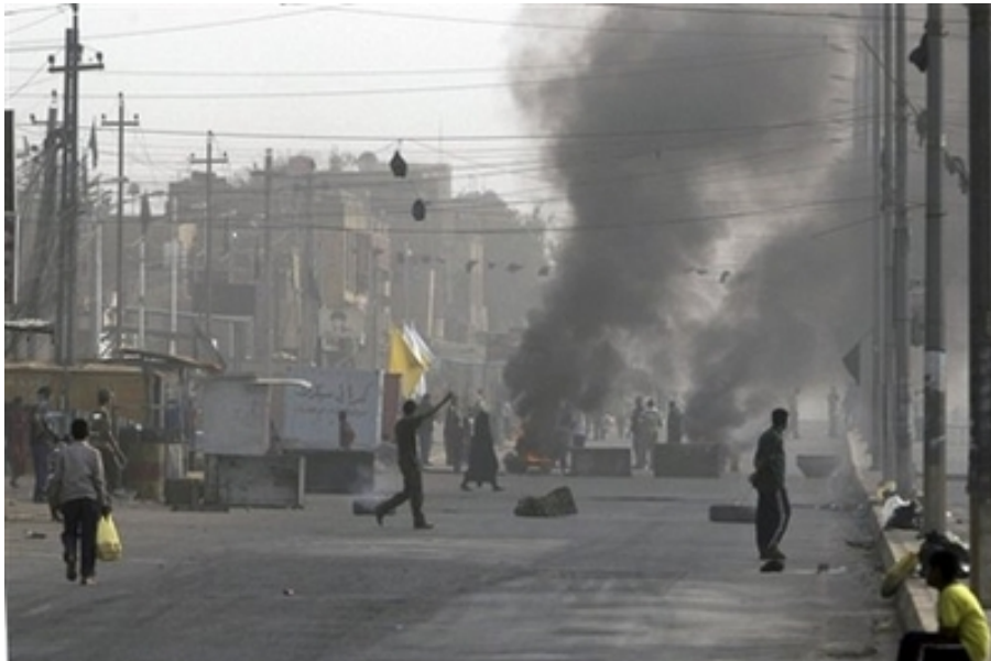
Tires are set on fire and road is blocked in Sadr City, Baghdad Mahdi Army militia members clash with the Iraqi government forces backed by the US military March 26, 2008.

Mahdi Army Fights Back After Idiots In U.S. Command Order Attacks On Their Forces: 18 Mortar Rounds Fall On US Bases And Combat Outposts On The East Side Of Baghdad; “Leaflets Saying ‘No, No To America’ Were Plastered On Each Storefront”