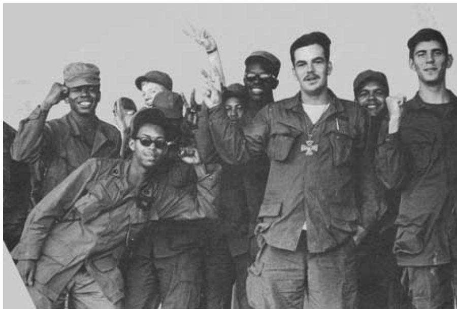
Vietnam Soldiers: Their Resistance Stopped An Imperial War

ORGANIZED BY: The Military Project: contact@militaryproject.org [With the assistance of Traveling Soldier & GI Special]