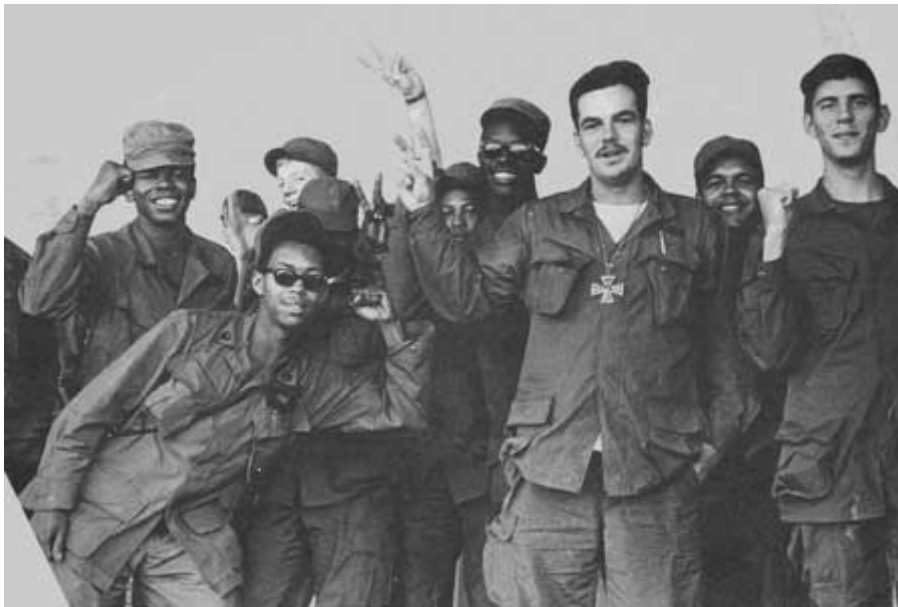
Vietnam Soldiers: Their Resistance Stopped An Imperial War

The Military Project: contact@militaryproject.org [With the assistance of Traveling Soldier & GI Special]