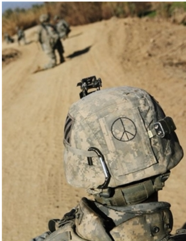
U.S. Army soldier patrols Beijia village, Iraq Feb. 4, 2008.

Middle Collegiate Church 50 East 7 th St., New York, New York