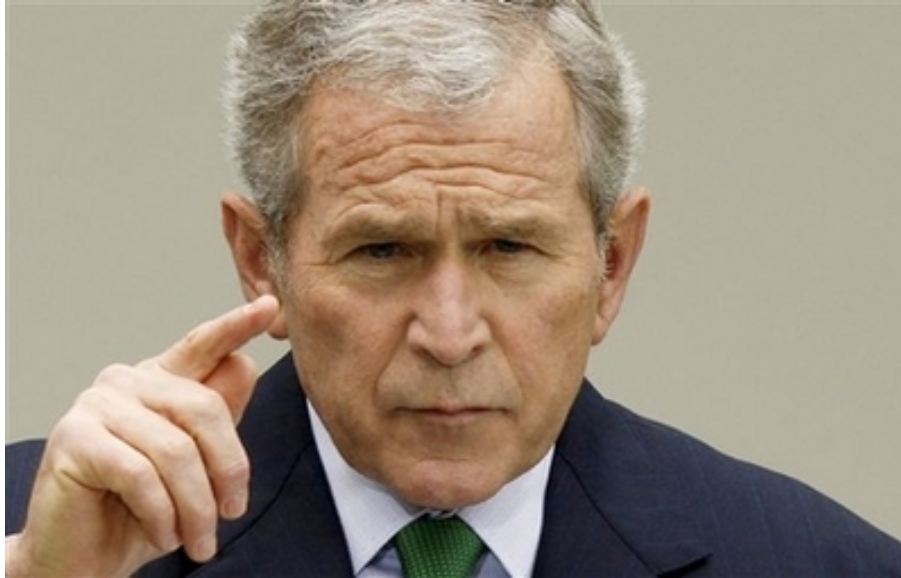
The traitor Bush April 29, 2008, in the White House.