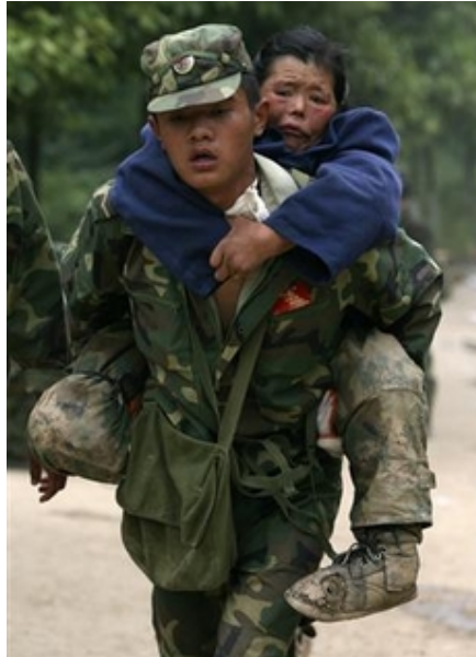
A Chinese Army soldier evacuates a woman to a relief centre in Beichuan, Sichuan province May 16, 2008.