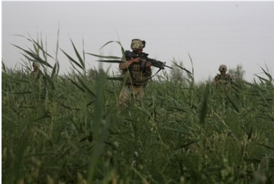
U.S. Marines from the 24th Marine Expeditionary Unit near the town of Garmser, Helmand Province, Afghanistan, May 3, 2008.