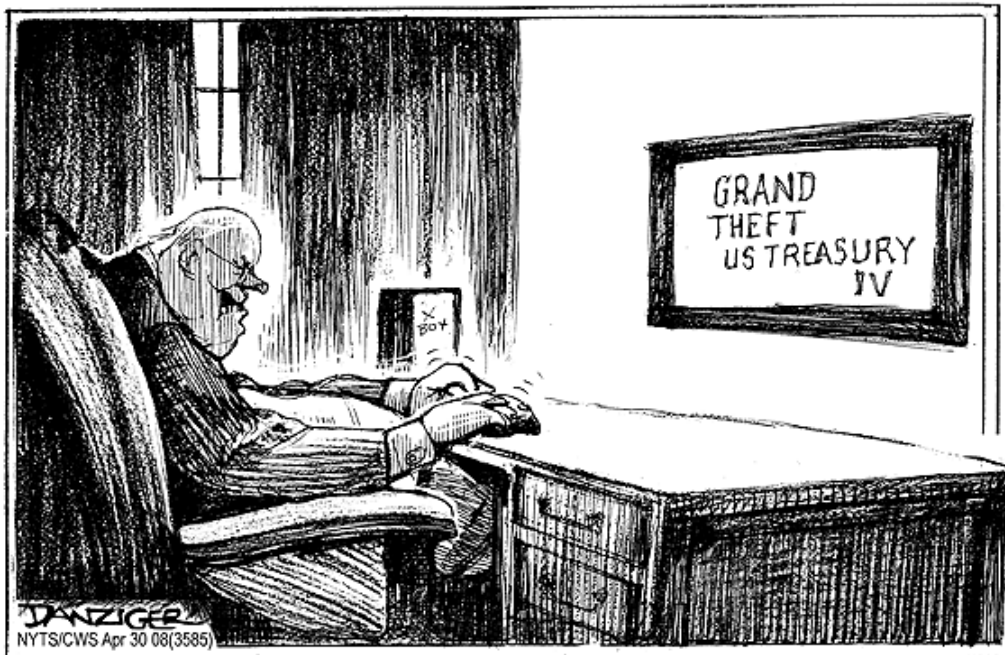
Mr. Cheney Updates His Favorite Game

“A FLYING YELLOW SUBMARINE SOARS ACROSS THE SKY WITH A HUGE FLUORESCENT BANNER