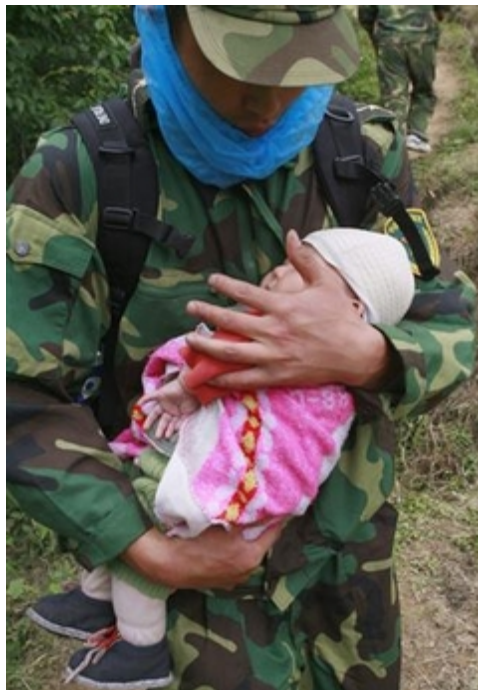
A soldier in the Chinese Army carries a baby at the earthquake-hit Beichuan county, Sichuan province, May 15, 2008.