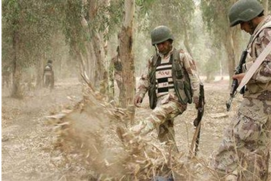
Iraqi soldiers join a patrol with U.S. soldiers from 1/8 2th MITT unit to look for explosives, at an open field in Mosul June 8, 2008.