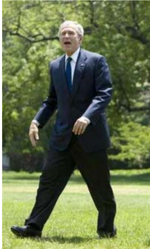
The enemy infiltrator arriving on the South Lawn of the White House in Washington June 8, 2008.