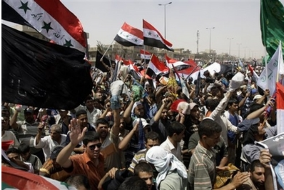
Iraqi nationalists rally in Sadr City in Baghdad June 13, 2008 against George Bush's demand for a U.S.-Iraqi security pact that would permit continued U.S. occupation of Iraq.