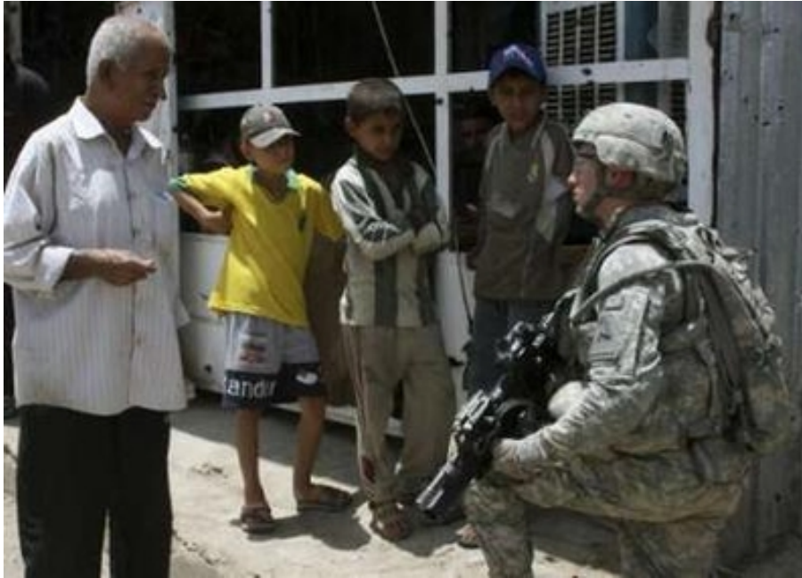
Iraqi face down a U.S. soldier on their street in Baghdad's Sadr City June 10, 2008.