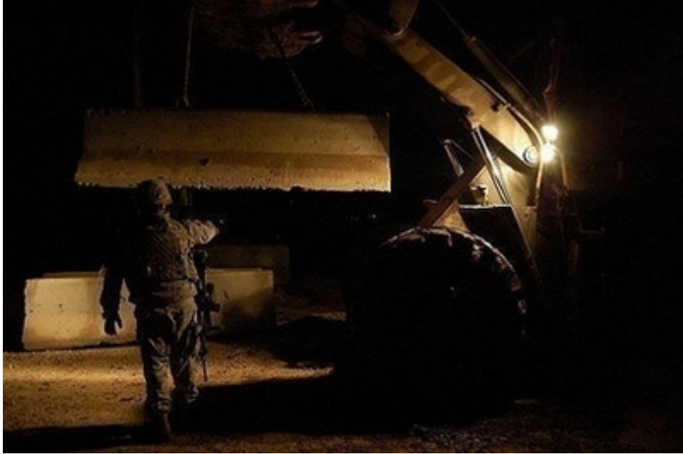
US military engineers move into place concrete barriers as they construct a fortified combat outpost in Mosul, on February 17.

FUTILE EXERCISE THEN: FUTILE EXERCISE NOW: ONLY 2 MILLION MORE TO SET UP IN 50 MORE MAJOR CITIES AND TOWNS: ALL HOME NOW!