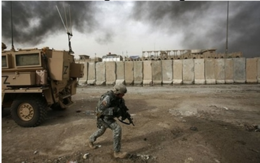
U.S. Army's soldier from the 4th Infantry Division runs through an open area during a patrol in Sadr City in Baghdad May 13, 2008.

THERE IS ABSOLUTELY NO COMPREHENSIBLE REASON TO BE IN THIS EXTREMELY HIGH RISK LOCATION AT THIS TIME, EXCEPT THAT A PACK OF TRAITORS IN D.C. WANT YOU THERE That is not a good enough reason.