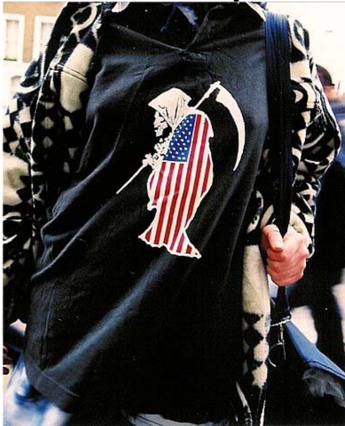
Anti-war rally in London 2004