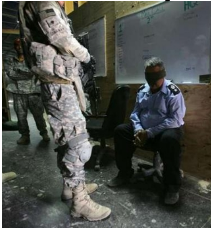
A U.S. soldier from the Second Stryker Cavalry Regiment guards an arrested Iraqi policeman at a U.S. military camp in Baquba, Diyala province August 19, 2008.