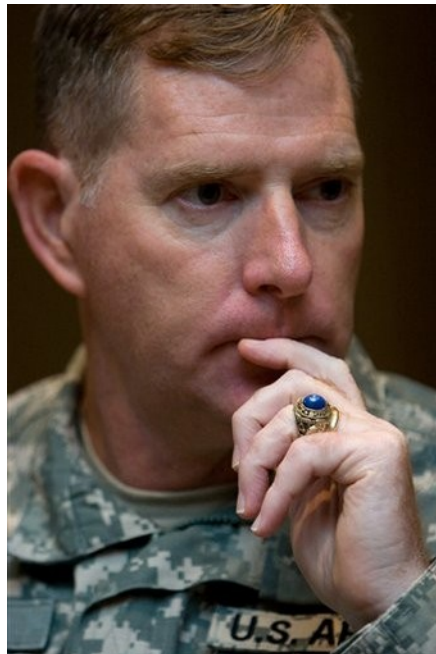
Enemy Combatant; Stupid And Dangerous: Maj. Gen. Peter Vangjel

Aug 20, 2008 By Gregg Zoroya - USA Today [Excerpts]