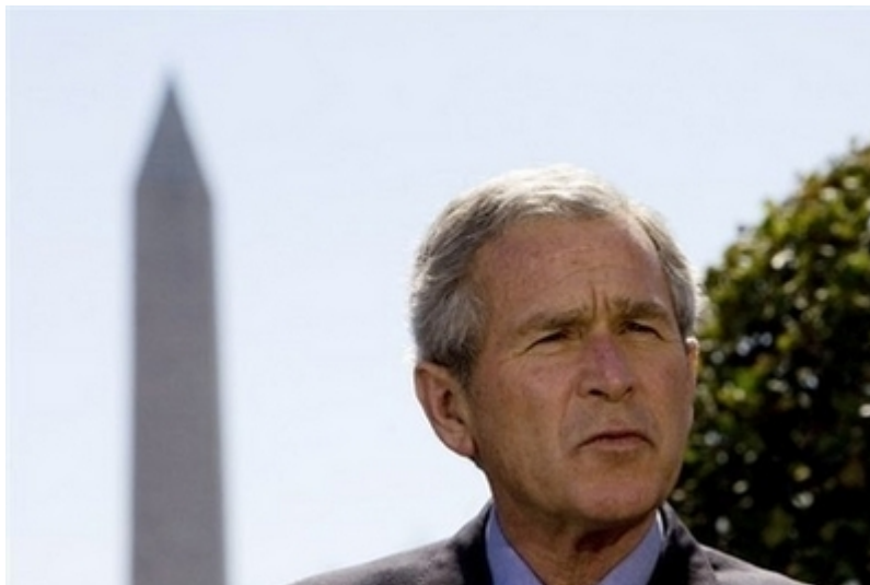
The Traitor Bush: No Honor, No Sense Of Duty