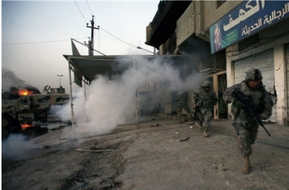
U.S. Army soldiers from the 4th Infantry Division take cover from snipers in Sadr City, Baghdad, May 12, 2008.