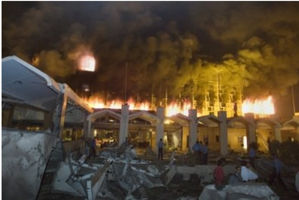
The Marriott hotel in Islamabad, Pakistan Saturday, Sept 20, 2008.