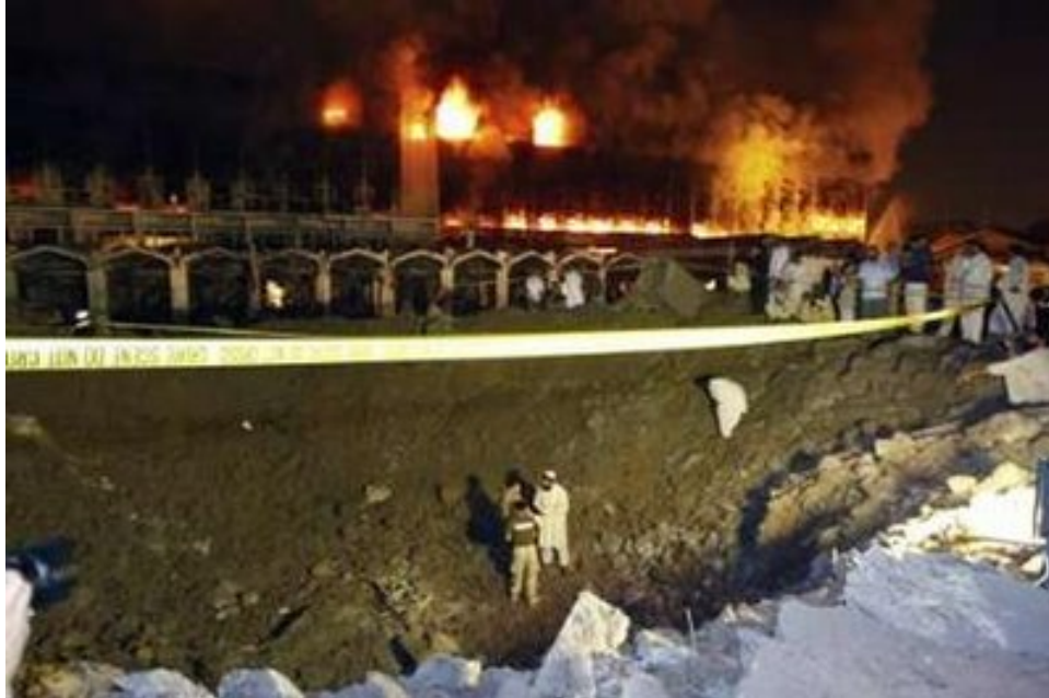
The crater from the bomb at the Marriott hotel in Islamabad September 20, 2008. A truck bomber attacked, killing at least 40 people, wounding nearly 250 and starting a fire that burned the building in the Pakistani capital.