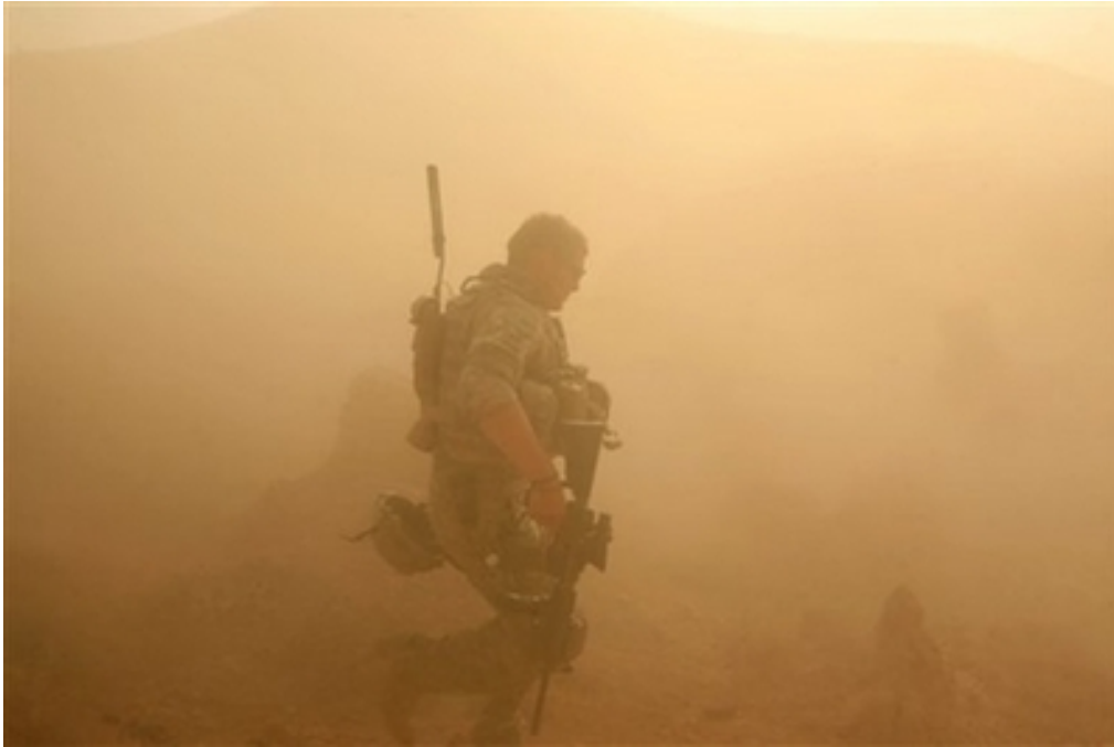
A U.S. Army soldier from 2nd Stryker Cavalry Regiment in the Hamrin mountains in Diyala province, July 22, 2008.