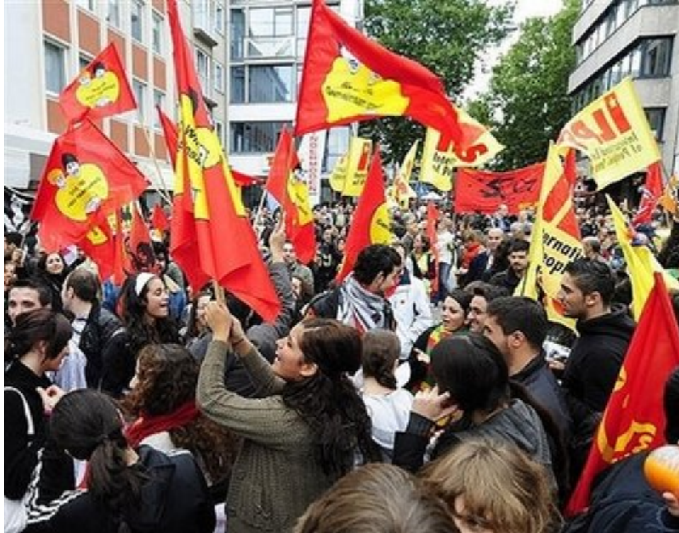
Counter-demonstrators celebrate the news that a rally of a neo-Nazi “anti-Islamification congress” was forbidden by the police for security reasons in the western city of Cologne.