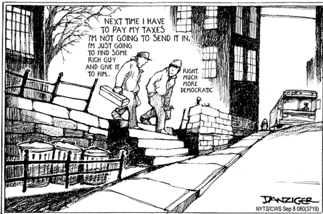
The Working Class