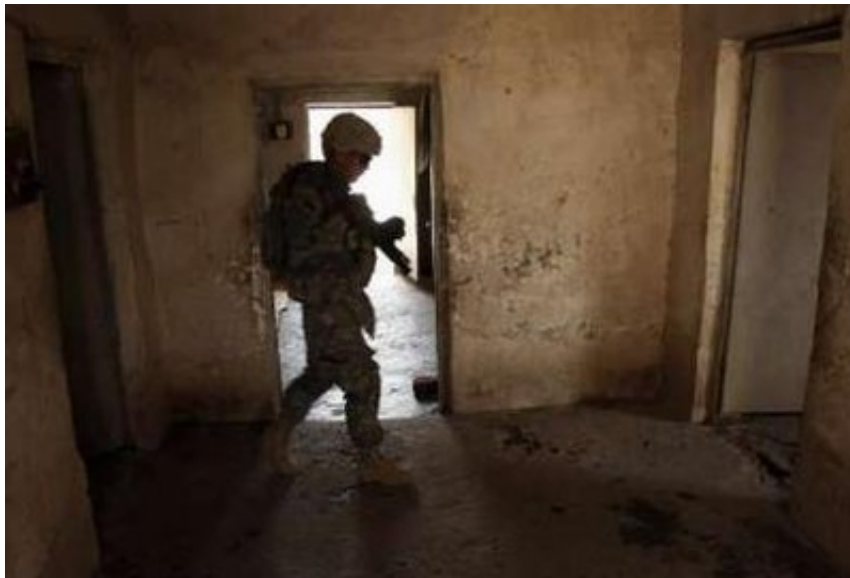
A U.S. soldier searches a house in Baquba in the Diyala province, 40 miles northeast of Baghdad October 14, 2008.