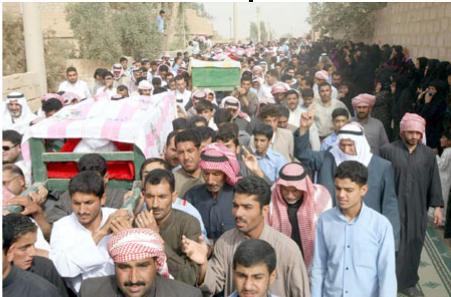
The Funeral Procession