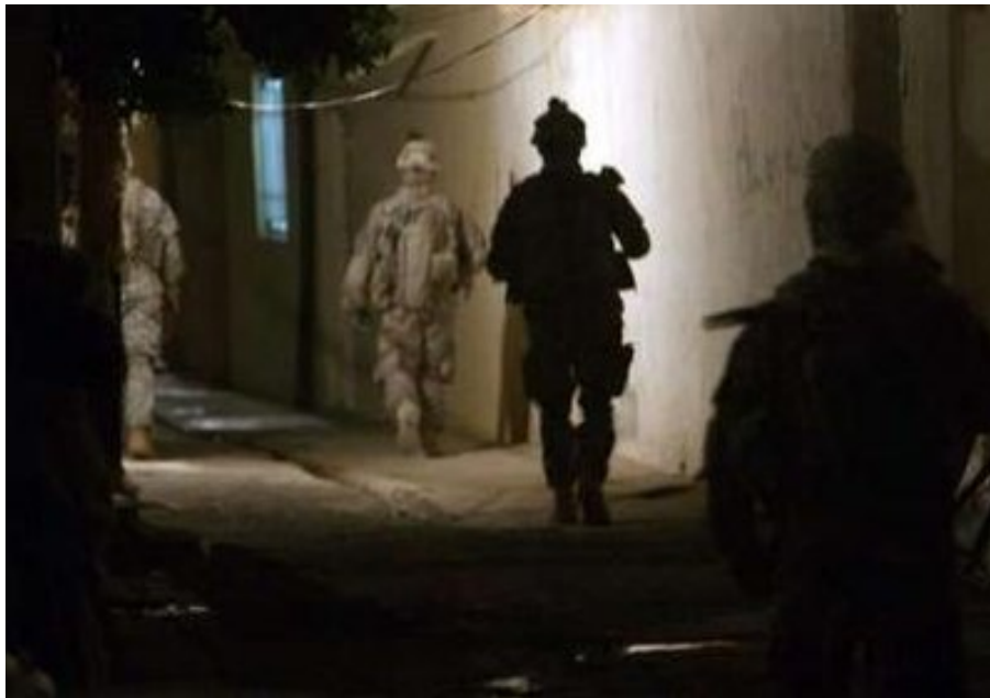
U.S. soldiers patrol in Baquba, in Diyala province some 65 km (40 miles) northeast of Baghdad, October 21, 2008.