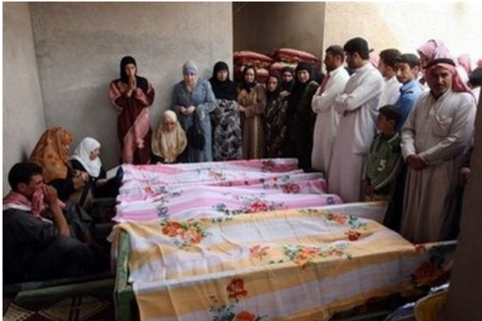
Syrians mourn over the coffins of their relatives killed by US military in the village of Al-Sukkariya, Syria on October 27, 2008.

The Arab workers assured support for Syria in its national and called on the Arab world to support it, and the international community in order to preserve international peace and security to put an end to the policy of using force