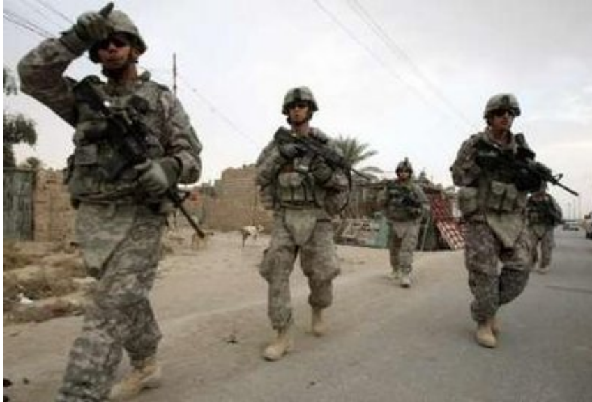
U.S. soldiers patrol a village near Baquba in Diyala province, some 65 km (40 miles) northeast of Baghdad October 18, 2008. REUTERS/Goran Tomasevic