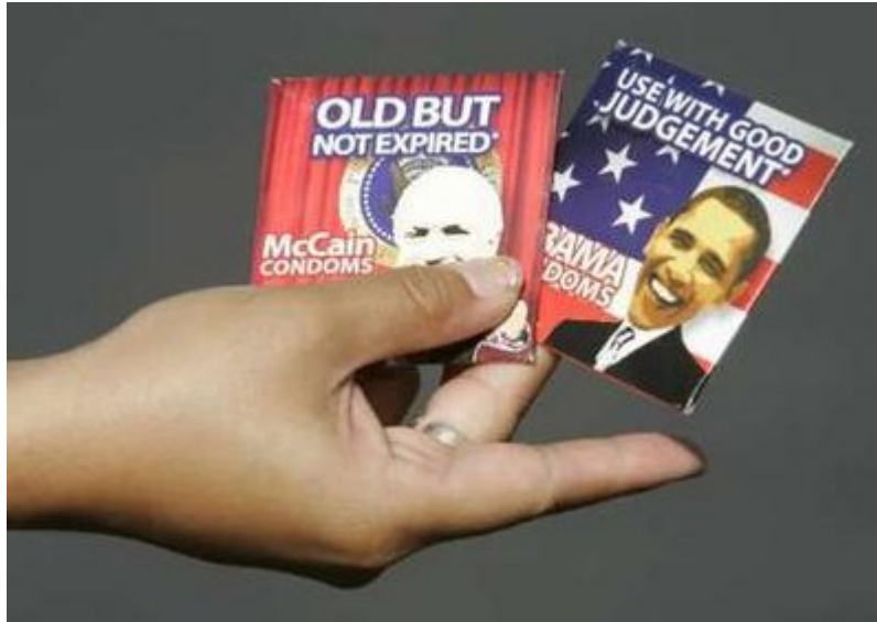
A vendor shows condoms with the likeness of McCain and Obama at an election rally, Bonanza High School, Las Vegas, Nevada October 25, 2008.

THERE IT IS: YOU GET TO CHOOSE WHICH ONE FUCKS YOU FOR THE NEXT FOUR YEARS