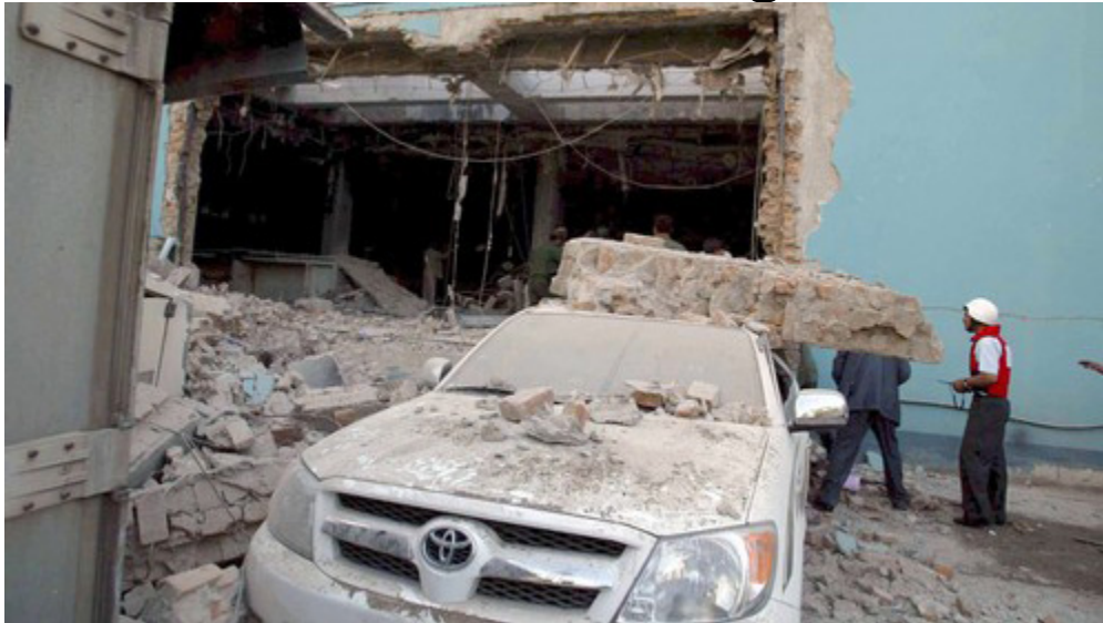
The scene after a bomber targeted the Information and Culture Ministry in Kabul, Afghanistan.