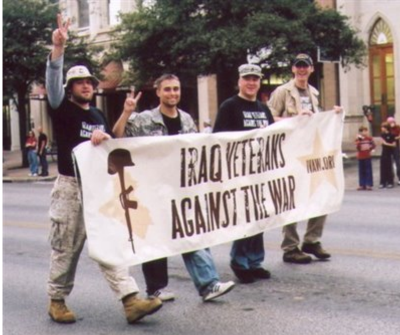
Members of Iraq Veterans Against the War march in Austin's Veteran's Day parade.