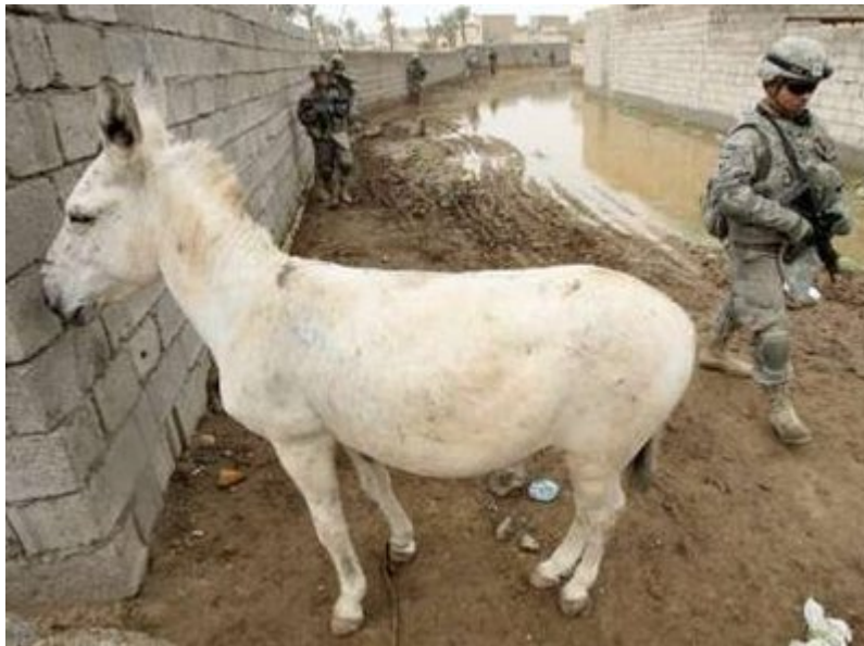
U.S. soldiers patrol Baquba, in Diyala province, October 29, 2008.