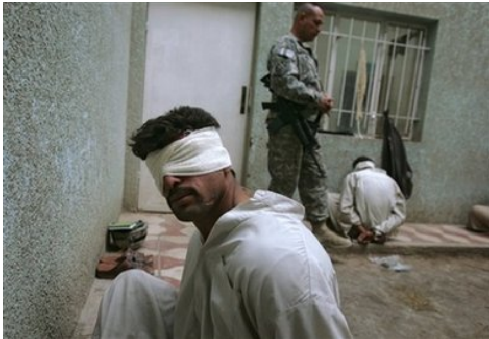
An American soldier stands guard, as blindfolded and handcuffed suspected insurgents arrested during recent operations wait to be questioned in Fadhilah, eastern Baghdad, Iraq, on Oct. 22, 2008.

FUTILE EXERCISE: ONLY 5 MILLION MORE TO GO: AND THEY’LL NEVER FORGET THIS: ALL TROOPS HOME NOW!