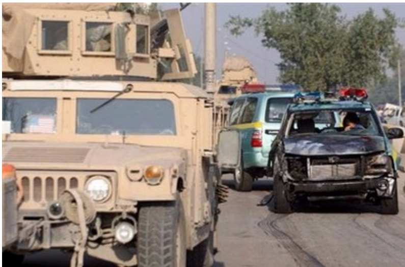
Nov 24: A damaged police vehicle, right, following a bomb outside the heavily-guarded Green Zone in central Baghdad.

IF YOU DON'T LIKE THE RESISTANCE END THE OCCUPATIONS