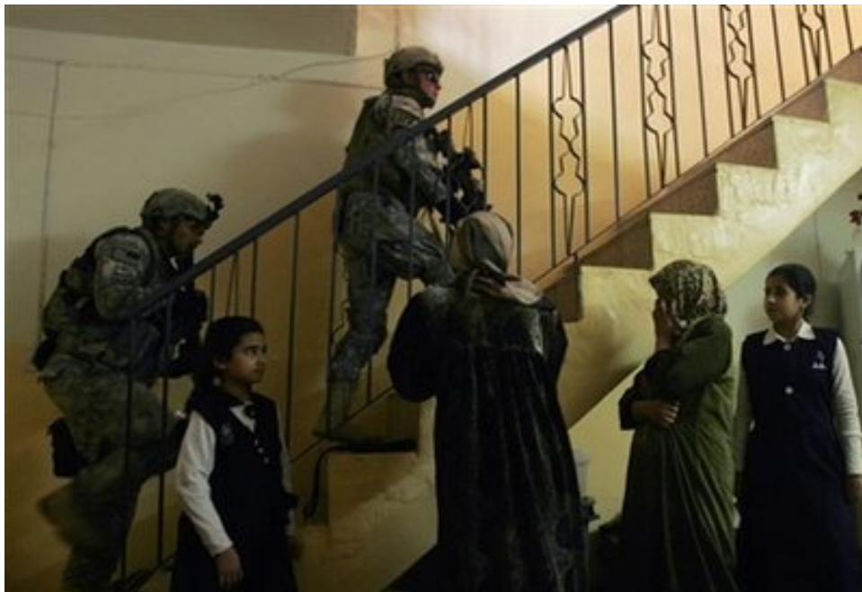
Foreign occupation soldiers from the US Army in an Iraqi citizen's house during an armed home invasion in Masariyah neighborhood, northwestern Mosul, Nov. 20, 2008.

[There's nothing quite like invading somebody else's country and busting into their houses by force to arouse an intense desire to kill you in the patriotic, self-respecting civilians who live there.