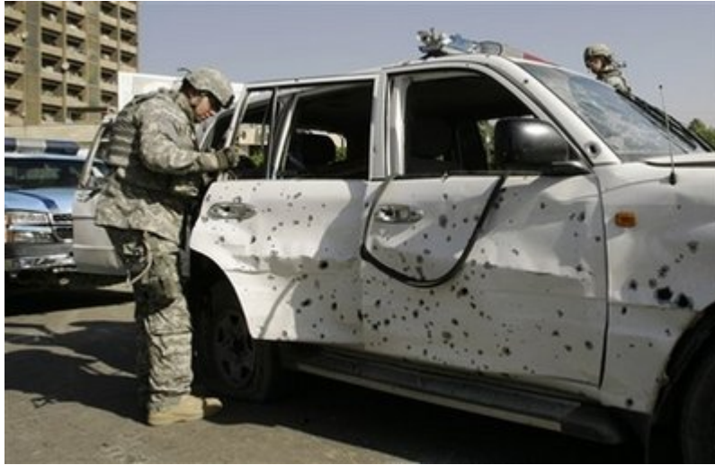
The wreckage of an Iraqi police vehicle at the scene of a roadside bomb, in Firdous Square, central Baghdad, Nov. 26, 2008.

A roadside bomb targeted a police patrol around 10:30 a.m. near Technology University in eastern Baghdad. Two police officers were injured.