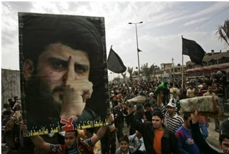
Demonstrators march in Sadr city, Baghdad, November 28, 2008. Thousands Iraqis held protests in Baghdad and other Iraqi cities after parliament passed a pact allowing U.S. occupation troops to remain through 2011.

I don't believe the (security agreement) will be good for Iraq. The political blocs signed it just for their own interests. The agreement has no interest for the future of Iraq.