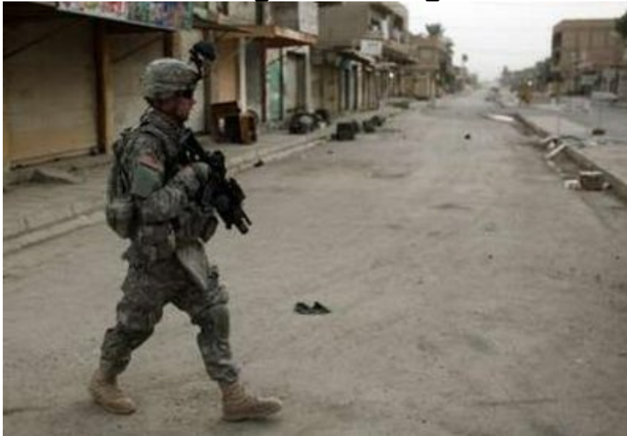
A U.S. soldier in Baquba, Diyala province, October 22, 2008.

THERE IS ABSOLUTELY NO COMPREHENSIBLE REASON TO BE IN THIS EXTREMELY HIGH RISK LOCATION AT THIS TIME, EXCEPT THAT A PACK OF TRAITORS IN D.C. WANT YOU THERE That is not a good enough reason.