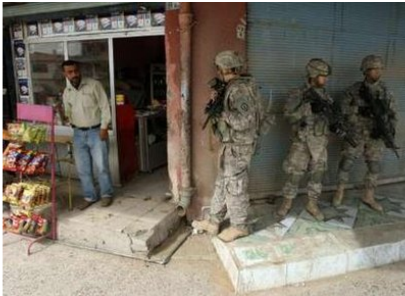
U.S. soldiers patrol Baqouba, in Diyala province, October 29, 2008.

Mosul: “If I Knew Of Any Insurgents In Our Neighborhood, I Wouldn’t Tell You. We Need To Stay Safe”