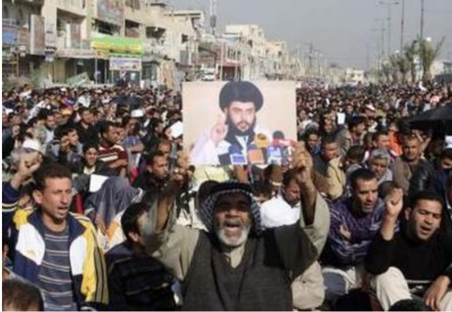
Thousands of Iraqis demonstrate against U.S. occupation of Iraq after Friday prayers in Baghdad's eastern Sadr city December 26, 2008.