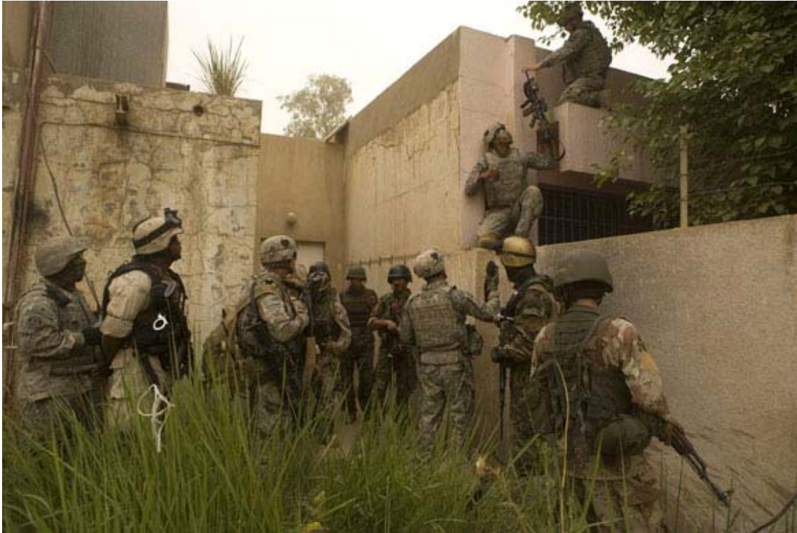
101st Airborne troops climb on to a roof to set up an observation post. [Thanks to JM, who sent this in.]