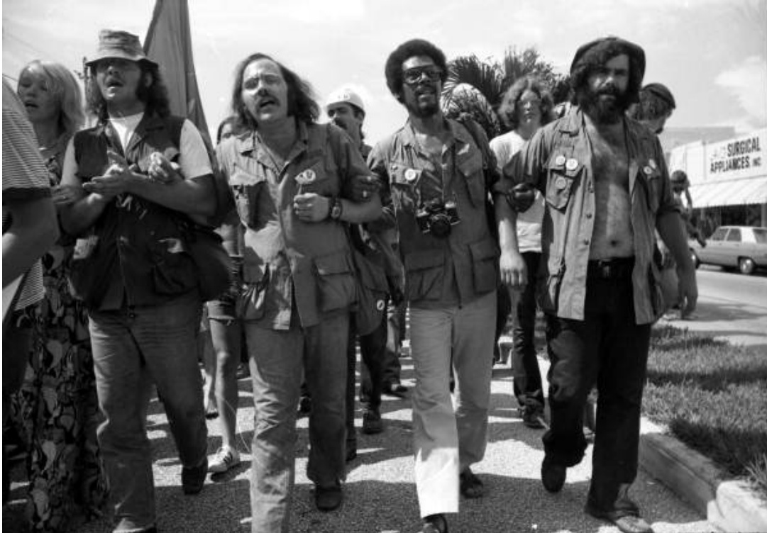
Vietnam Veterans marching against the war during the 1972 Democratic Convention : Miami Beach, Florida: December 23, 2008