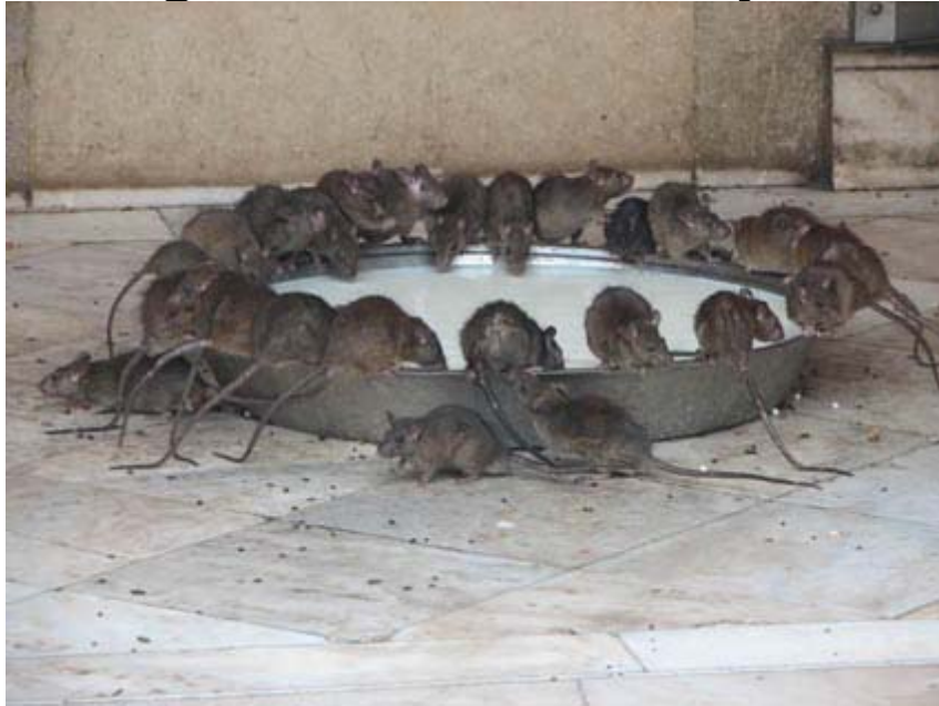
Boston police relax after a hard day at work committing criminal acts.

[Instead of dying for the Empire overseas, one more reason to Bring All Our Troops Home Now is so they can defend us against armed domestic enemies at home, and sweep pukes like these Boston Police off the streets once and for all. Facing troops, watch how fast the cowardly slime in blue run away. Payback is overdue. T]