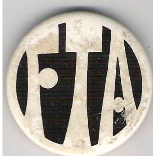
Pin, Vietnam Days: T