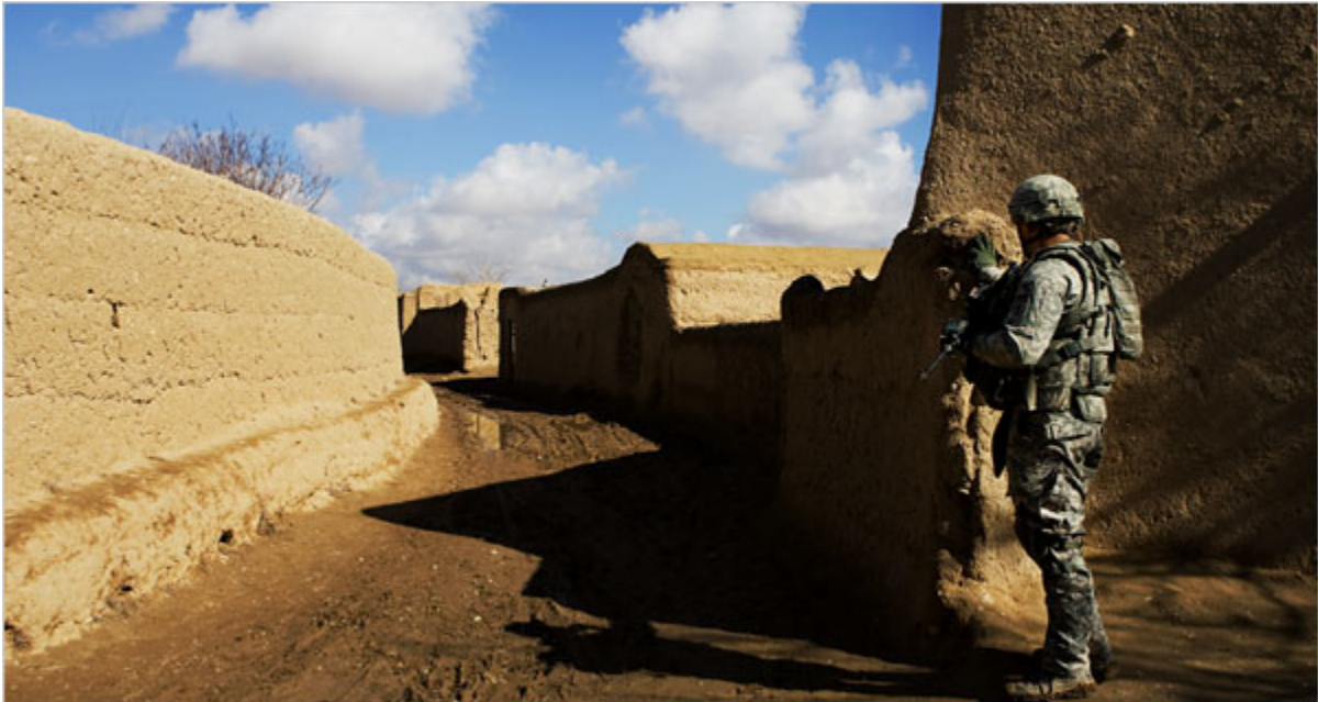
American Army soldiers, thinly spread, patrolled the Afghan village of Tsapowzai recently. January 22, 2009