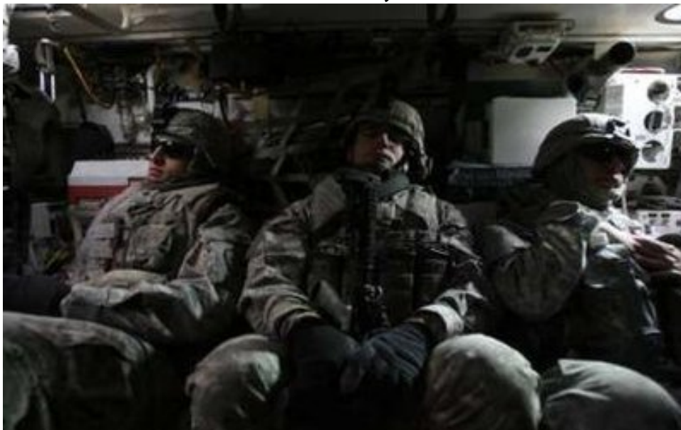
U.S. soldiers of 1-14 Infantry Battalion inside their armoured vehicle on the way back to the U.S. military Camp Taji after a mission near Baghdad, January 1, 2009.