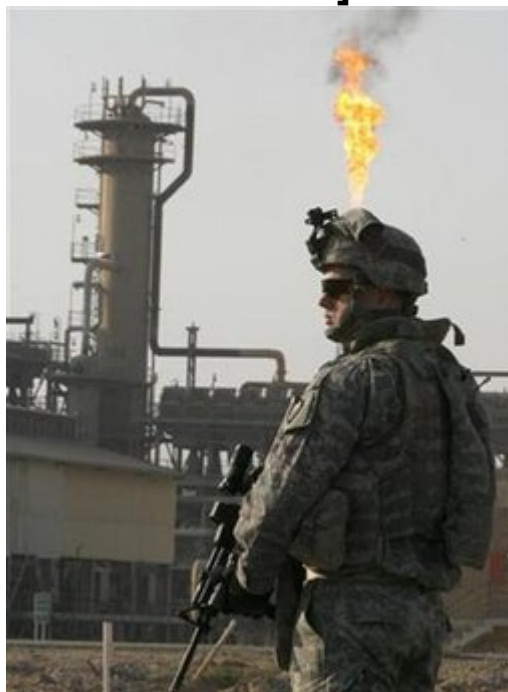
A U.S. soldier of 3rd Brigade Combat Team, Infantry Division stands guard at Baiji oil refinery north of Baghdad, January 22, 2009.