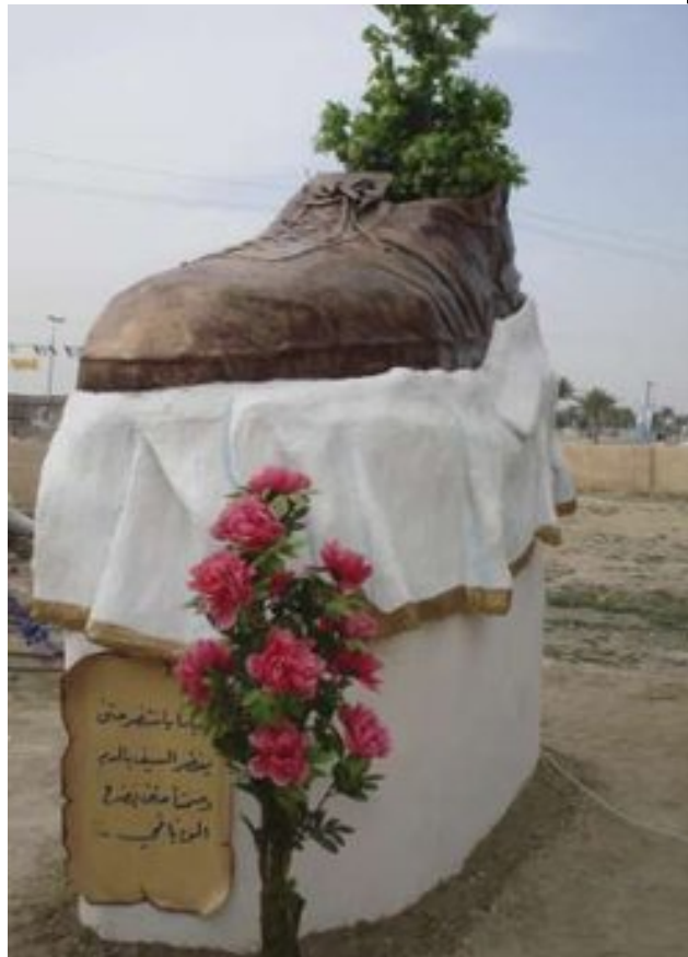
A statue built for Iraqi journalist Muntazer al-Zaidi, who hurled his shoes at former U.S. president George Bush, is seen in Tikrit, January 27, 2009. The sign reads “Muntazer is