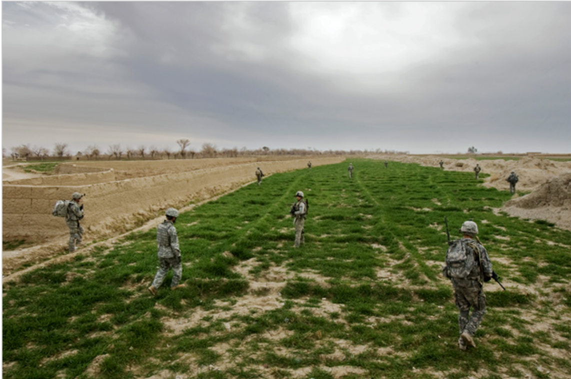
American Army soldiers, thinly spread, patrol in Afghanistan. January 22, 2009