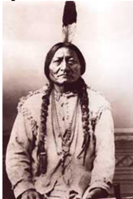
Sitting Bull: One of several chiefs who refused to comply.