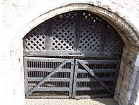
The Traitors' Gate, London

The name Traitors' Gate has been used since the early seventeenth century, prisoners were brought by barge along the Thames, passing under London Bridge, where the heads of recently executed prisoners were displayed on pikes. The prisoners were shocked by the sight of the heads of the recently executed stuck on spikes on the stone gate houses.