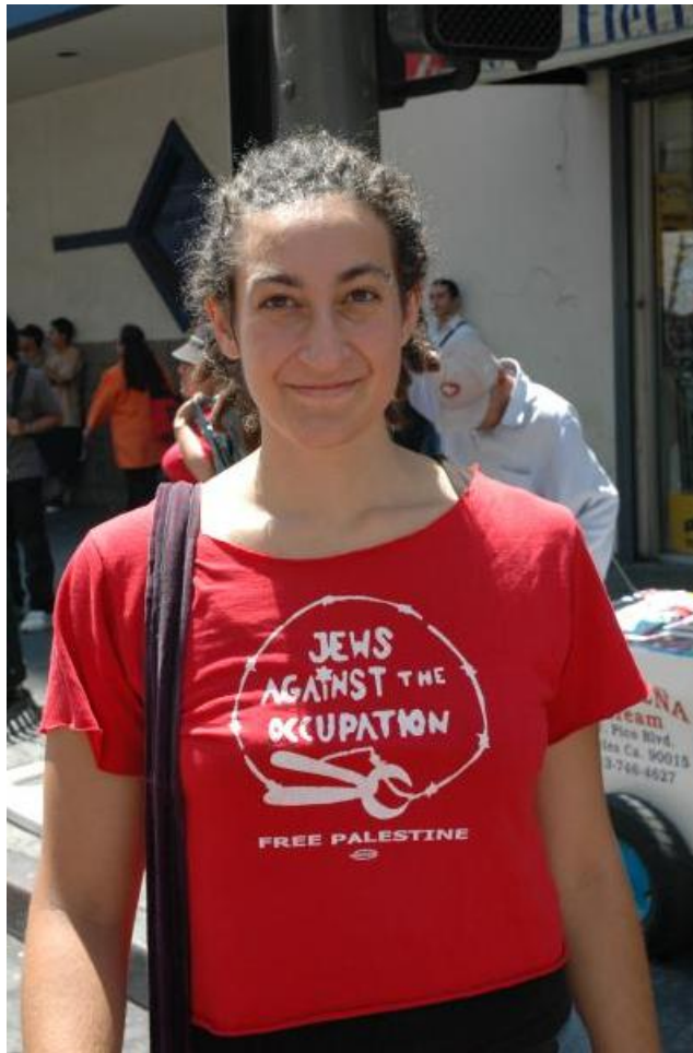
Thousands marched in downtown L.A. against the U.S. backed Israeli war on Lebanon Aug. 12, 2006.