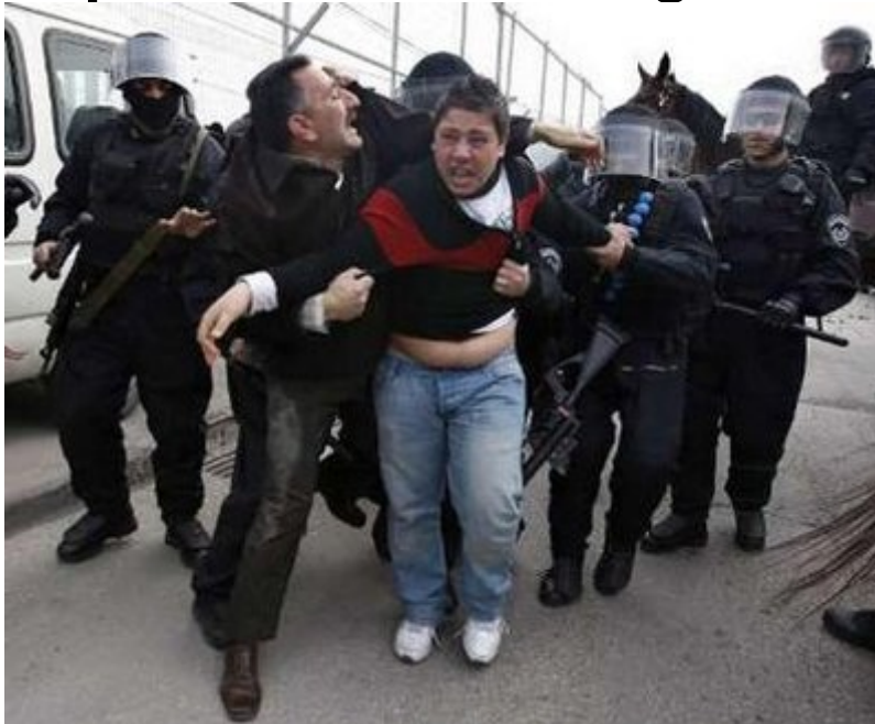
A Palestinian man tries to prevent Israeli border police from taking his son, who was suspected of throwing stones during scuffles, in occupied Jerusalem, Palestine, January 16, 2009.