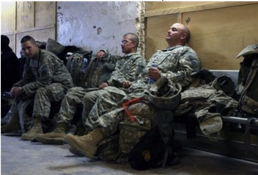
U.S. soldiers at the airfield in Kandahar province south of Kabul, Afghanistan, Dec. 29, 2008. The Obama administration is preparing to pour at least 30,000 more U.S. troops into the Afghanistan, (AP Photo/Rahmat Gul)