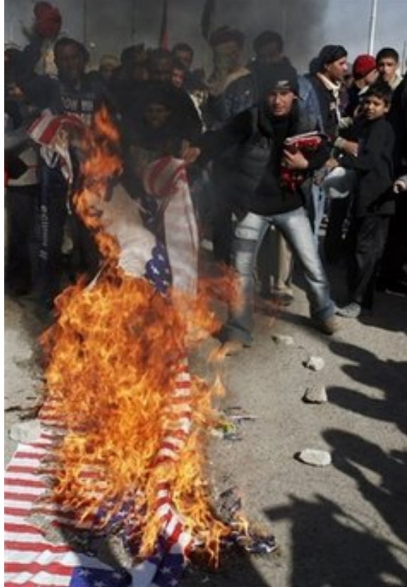
Iraqis burn the U.S. flag as they protest Israeli military operations in the Gaza Strip, Palestine, during Friday prayers in Sadr City, Baghdad, Iraq, Jan. 16, 2009.