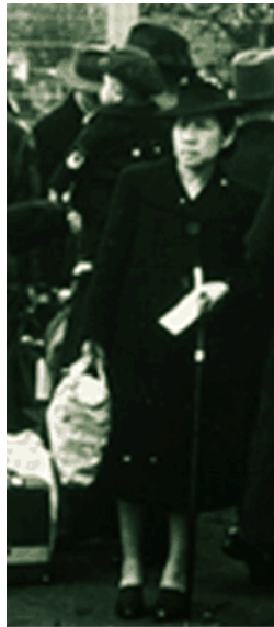
Japanese American residents board the bus for Camp Harmony, 1942

Carl Bunin Peace History Peace History February 18-24