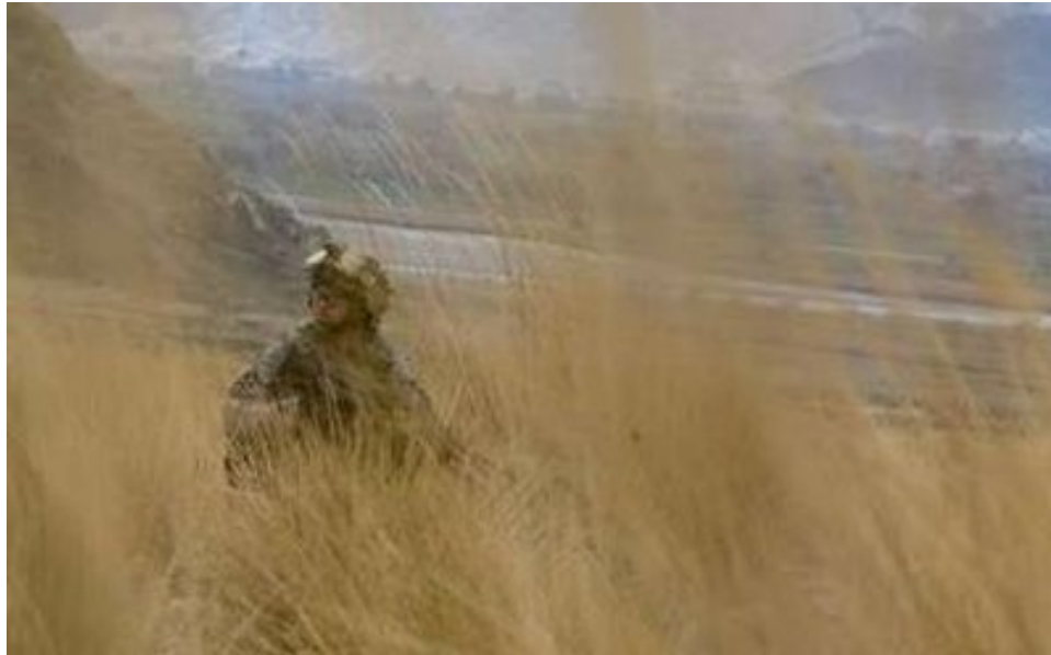
A U.S. soldier with 32nd Infantry Regiment during a patrol at the village of Tutnaw, Kunar Province, eastern Afghanistan February 10, 2009.