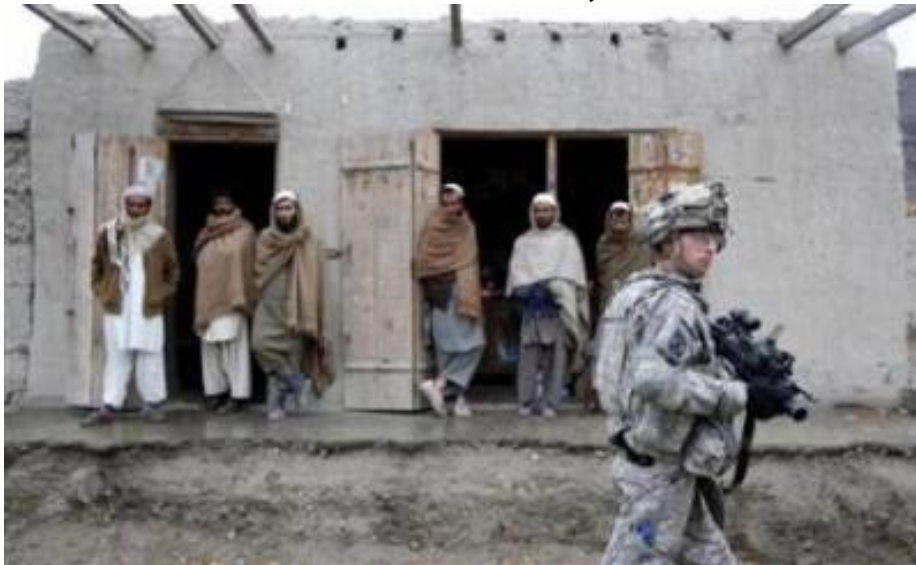
A U.S. soldier with the 32nd Infantry Regiment during a house-to-house search in the village of Semkar, Kunar Province, eastern Afghanistan February 12, 2009.