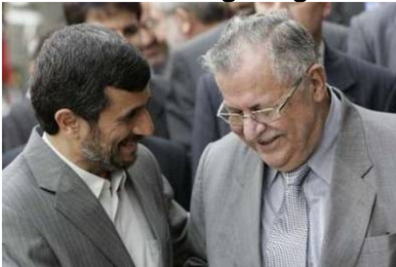
Iranian President Mahmoud Ahmadinejad (L) welcomes his Iraqi counterpart Jalal Talabani during an official welcoming ceremony in Tehran, February 27, 2009.