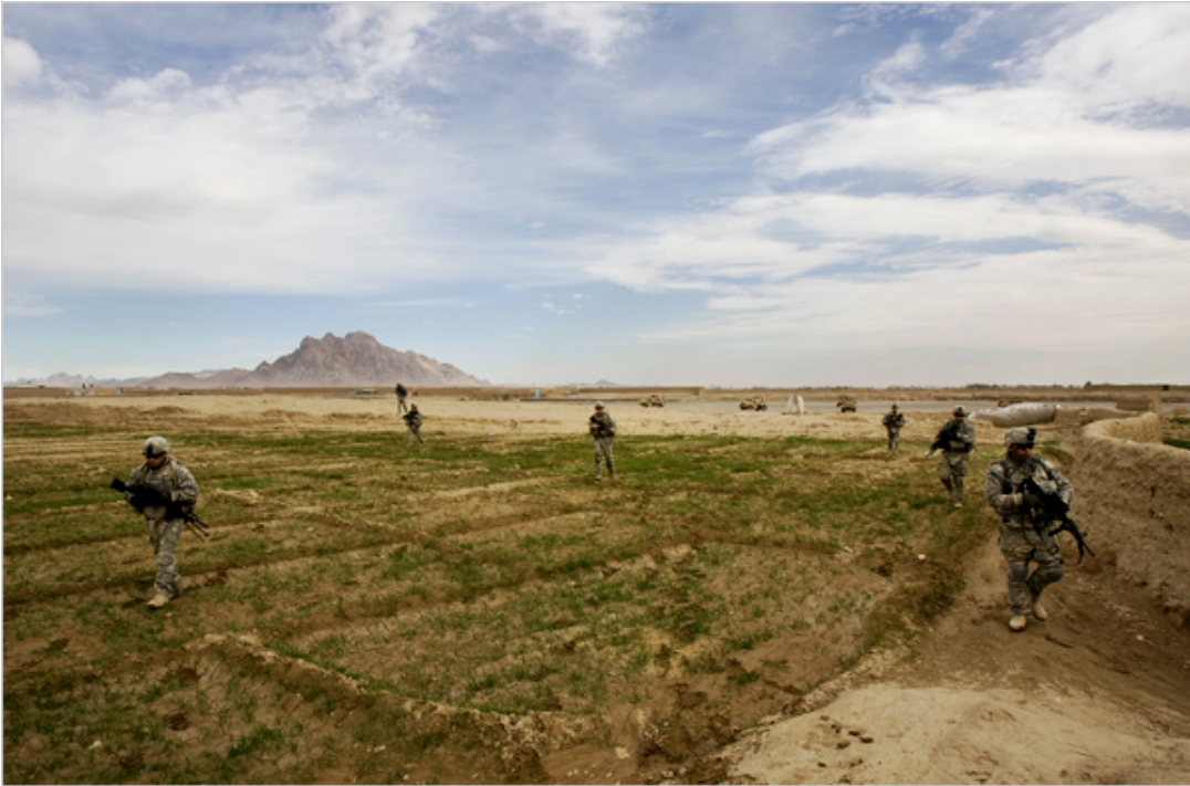
American Army soldiers patrol in Afghanistan.