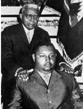
Jean-Claude 'Baby Doc' Duvalier with his father Francois 'Papa Doc' Duvalier