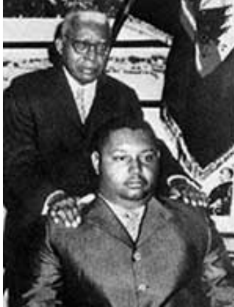
Jean-Claude 'Baby Doc' Duvalier with his father Francois 'Papa Doc' Duvalier