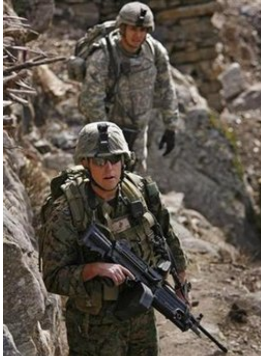
A US Marine and a soldier with the US Army's 6-4 Cavalry make their way patrol near Combat Outpost Keating in eastern Afghanistan January 21, 2009.