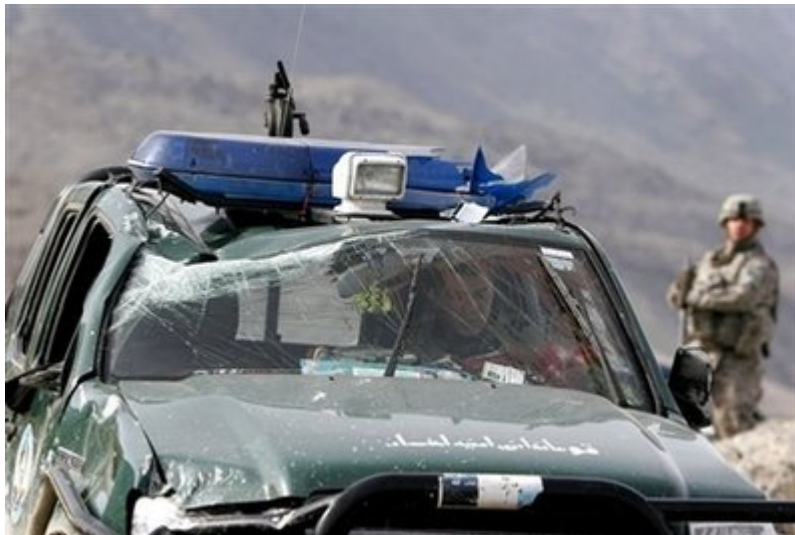
U.S. soldiers at a damaged police vehicle following an attack by Taliban militants on Jalalabad-Kabul highway, east of Kabul, Afghanistan, on Feb. 7, 2009.

Feb 6, 2009 AFP & Ahmad Omid Khpalwak, PAN & Feb 7 (Reuters)