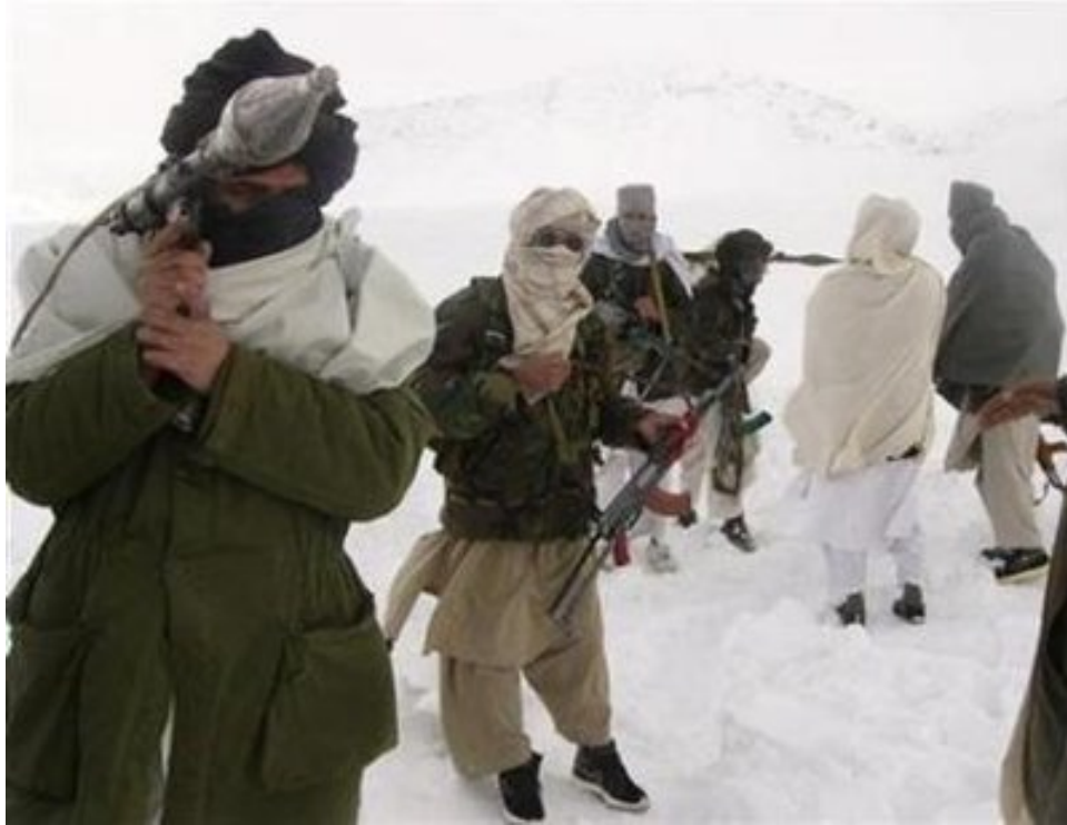
January 17, 2009: Taliban resistance soldiers in an undisclosed location in Afghanistan January 16, 2009.