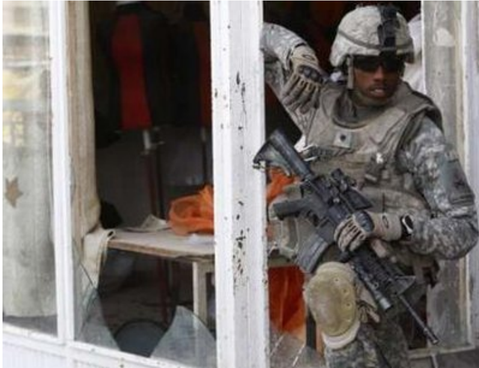
U.S. soldier at the site of a bomb attack in Baghdad's Sadr City February 15, 2009.