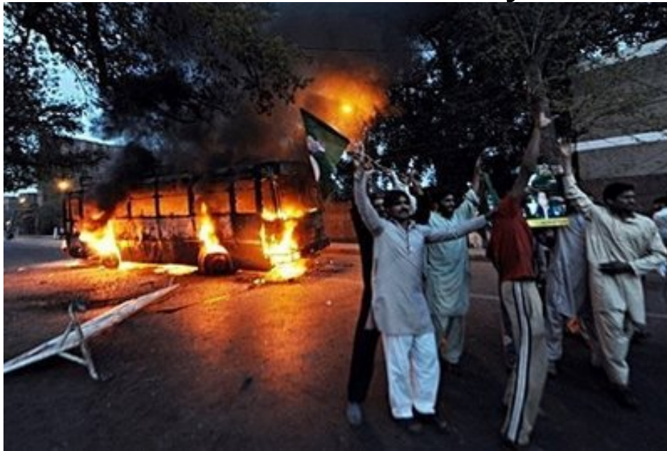
Pakistani opposition party activists celebrate in front of a burning police bus in Lahore. Activists overwhelmed riot police, shaking government authority.