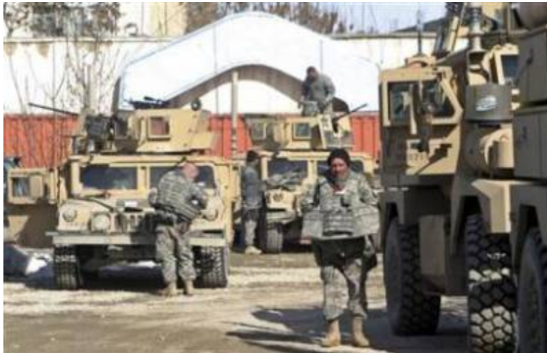
U.S. soldiers prepare to go for a patrol in Ghazni province February 18, 2009.