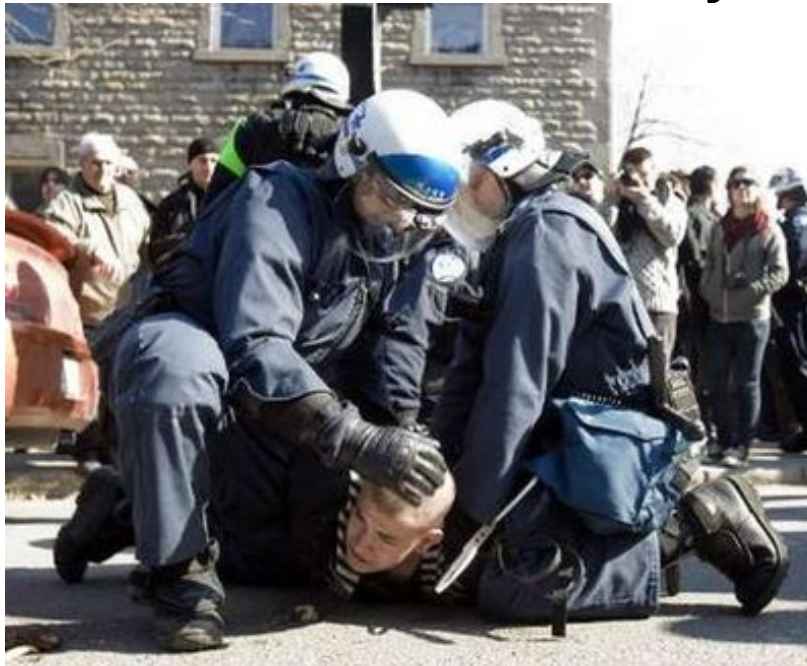
A protestor is arrested during an annual march against police brutality in Montreal March 15, 2009.