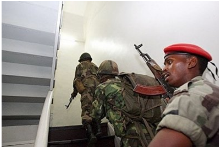
Madagascan soldiers loyal to the opposition movement storm the office of President Marc Ravalomanana in Antananarivo.

But 70% of the 20 million population still lives on less than $2 (£1.40) a day and correspondents say the opposition has tapped into popular frustration at the failure of this new wealth to trickle down.