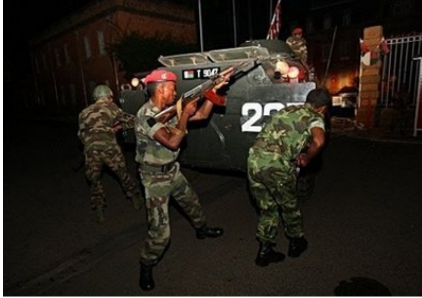
Madagascan soldiers loyal to the opposition movement take over the office of President Marc Ravalomanana in Antananarivo.