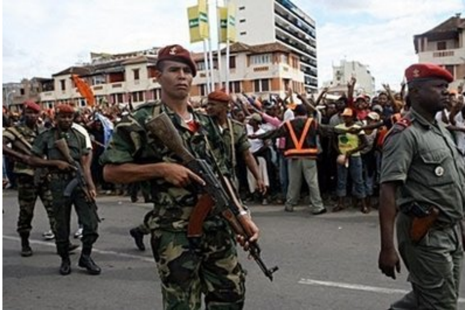
Madagascan soldiers stand guard to protect civilians at a demonstration against the government of President Ravalomanana in Antananarivo.