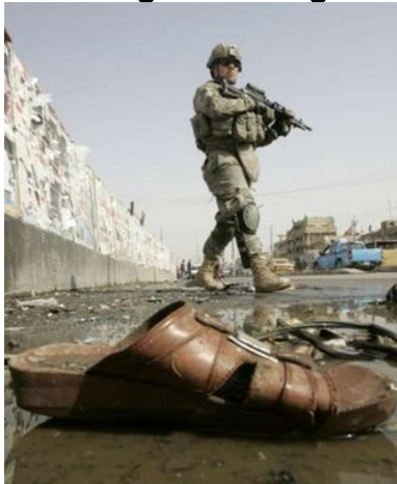
A U.S. soldier near the footwear of a victim after a bomb attack in Baghdad's Sadr City February 15, 2009.

THERE IS ABSOLUTELY NO COMPREHENSIBLE REASON TO BE IN THIS EXTREMELY HIGH RISK LOCATION AT THIS TIME, EXCEPT THAT THE PACK OF TRAITORS THAT RUN THE GOVERNMENT IN D.C. WANT YOU THERE TO DEFEND THEIR IMPERIAL DREAMS: That is not a good enough reason.