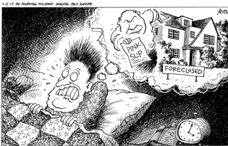
THE AMERICAN DREAM