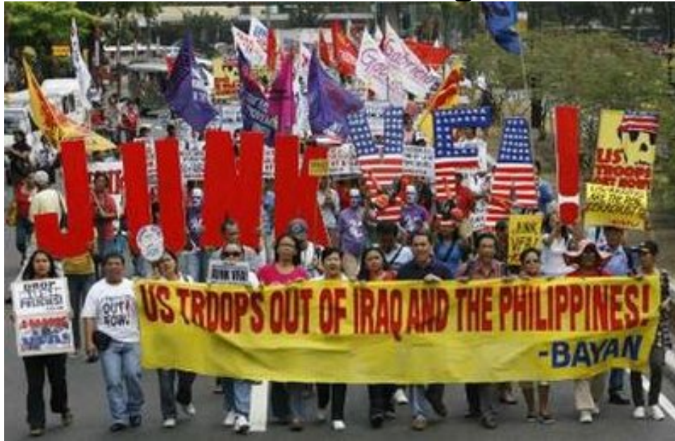
Philippine citizens march on the U.S. embassy in Manila March 21, 2009 to mark the sixth anniversary of the United States invasion of Iraq and to demand the abrogation of the controversial Visiting Forces Agreement (VFA) which allows the presence of the U.S. forces in the Philippines and gives them certain special privileges when it comes to criminal prosecution.